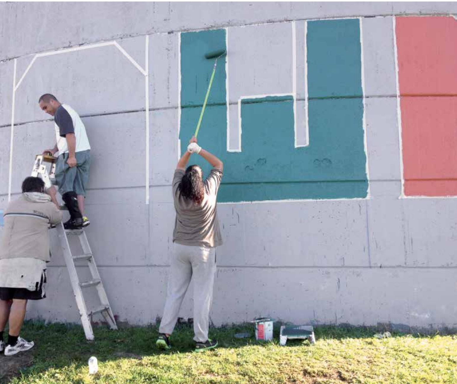
Te Menenga Pai Trust creating the Newtown water tank mural.