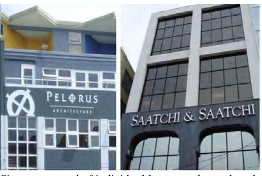
Signs composed of individual letters and not placed on any backing panel are less dominating and integrate better with the building

Note, a maintenance plan/strategy including proposed methods of cleaning, replacement of defective lighting and a detailed maintenance schedule can also help ensure signs are well-maintained.