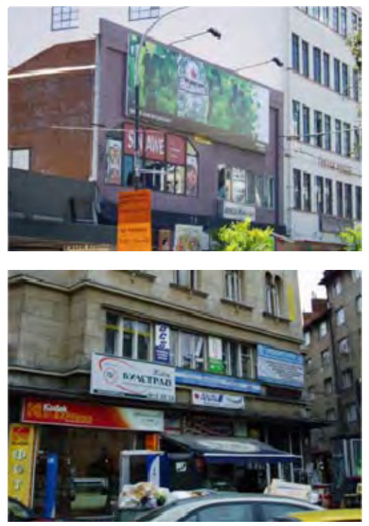
Numerous signs of contrasting size, style, type, colour and graphics, viewed in close proximity, add to the collective effect of clutter