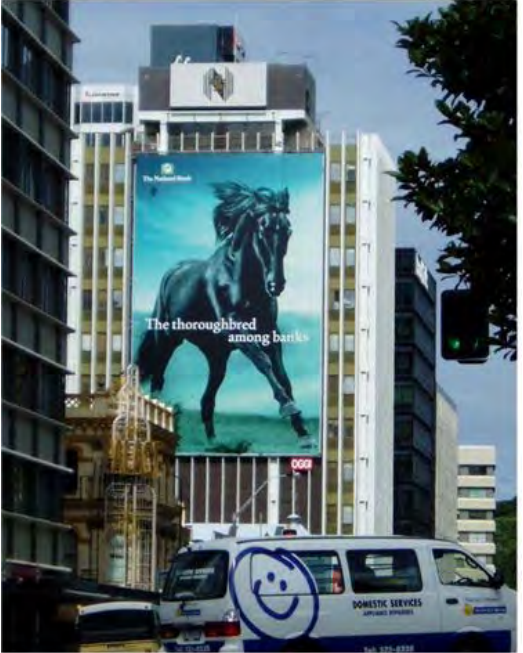
Larger signs are generally more appropriate in locations that will be viewed from further away. From the two examples, the top one works better as the sign is attached to, and set back within an expansive blank wall rather than crowding adjoining windows