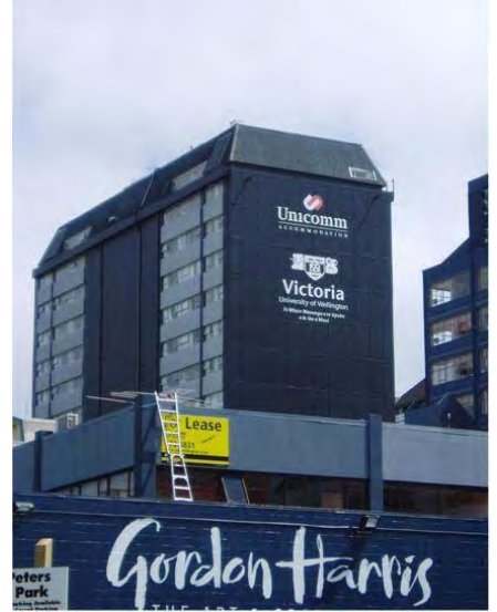
Example of signs painted on the building exterior