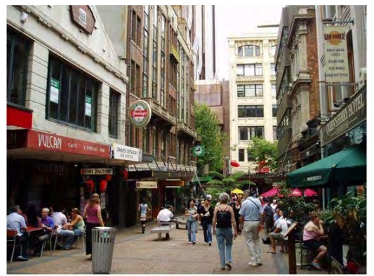
Signs are accepted as an essential part of the commercial character and activity in the city

The design principles presented in this Design Guide encourage appropriate signage that makes a positive contribution to the city.