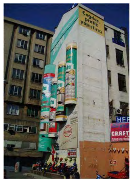
Example of three-dimensional signage