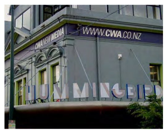
Innovative and appropriately illuminated sign that works well both during the day as well as at night