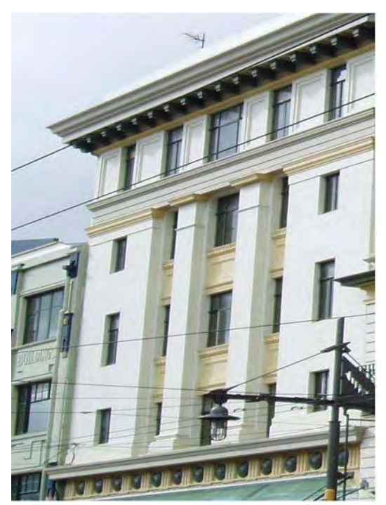
Architectural features (defined in section 4) help to 'sub-divide'/articulate the building façade and provide visual interest and a sense of relief. The size, proportions and arrangement of these elements determine the architectural composition of the building façade. The intensity and imagery of the façade elements/features determine the architectural style of the building and its detailed design quality.

'Visual obtrusiveness' is directly linked to the scale, location and prominence of the sign, and the method and intensity of any illumination. For instance, highly visible signs that are oversized, brightly illuminated and/or moving can easily become visually obtrusive. The character of the surrounding environment also influences visual obtrusiveness. For example, any given sign may seem either appropriate or obtrusive, depending on the scale of the surrounding space and the distance from which it is viewed.