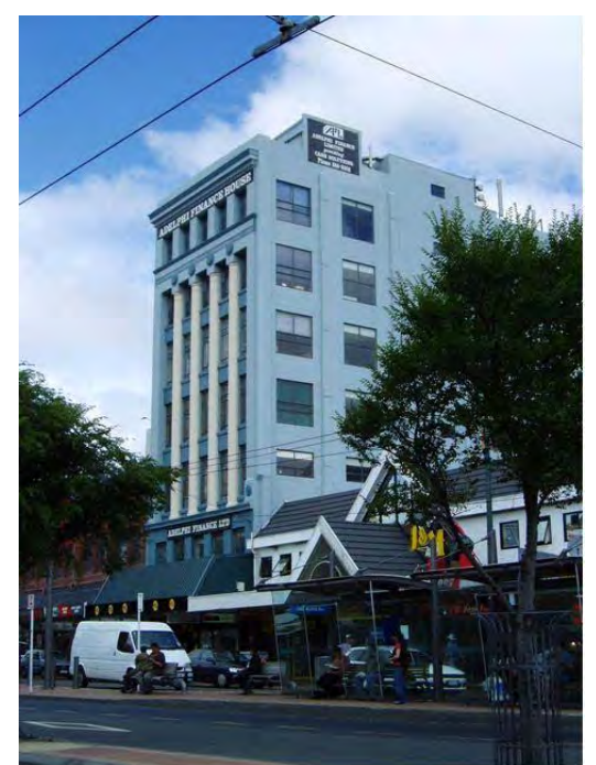
Well designed and suitably located signs can contribute to the commercial vitality of businesses in the city and provide a sense of direction

The Design Guide is in three main parts. The first identifies the key characteristics of well-designed signage in terms of scale and location, relationship to context, implications for road safety and other issues. The second part contains the design guidelines: these are applicable to all signage in Wellington City. The third part provides additional guidelines that apply to specific types of signs, including those relating to heritage items (such as buildings, areas or trees). However, heritage-related signs are not covered in detail: readers should also refer to the District Plan heritage provisions (Chapters 20 and 21) and any specific guidelines for heritage buildings/areas.