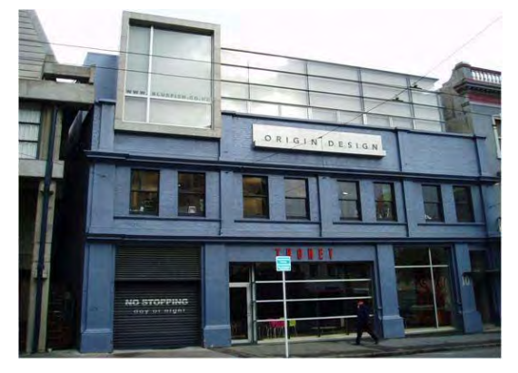
Good example of identification signage of high design quality that respects the character and context of the 'host' building

Heritage items (buildings, objects, trees and areas) have special significance to the city. Signs relating to them should be designed and located carefully to avoid detracting from the special qualities of the heritage item, especially