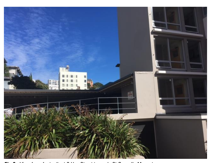
\textbf{Fig 8:} \ \ \text{View from footpath at 3 Hay Street towards St Gerard's Monastery}