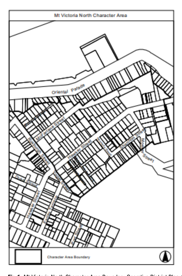
Fig 1: Mt Victoria North Character Area Boundary Operative District Plan (refer Mt Victoria North Character Area Design Guide, p.2)

The Mt Victoria North Townscape Precinct follows the boundaries set by the Mt Victoria North Character Area in the Operative District Plan (ODP) and renames it as the Mt Victoria North Townscape Precinct (refer Fig 1).