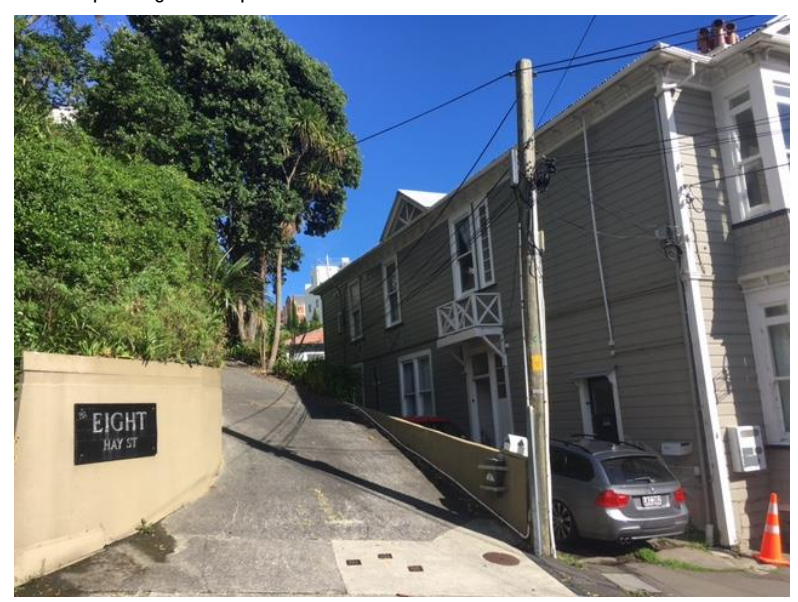
Fig 7: View from footpath at 8 Hay Street towards St Gerard's Monastery

Oriental Parade buildings which frame the views. Similarly, development under the proposed increased height in the vicinity of Hay Street will not be prominent in views from the central city or the waterfront and will have no direct visual impact on the Monastery or the overall townscape image of the precinct.