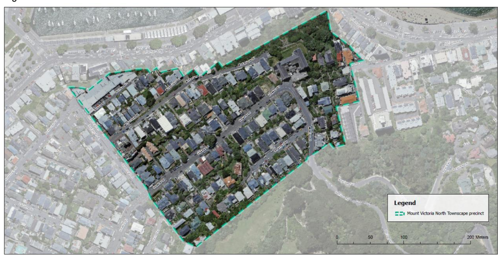
Fig 2: Wellington Draft District Plan: Mt Victoria North Townscape Precinct

Boundaries - the boundaries of the Mt Victoria North Townscape Precinct under the DDP are outlined in Fig 2 below.