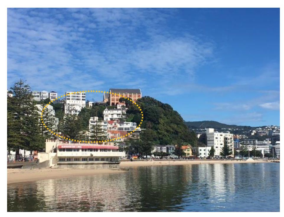
Fig 4: View from Oriental Parade looking west (Oriental Terrace cluster of sites outside the character precinct)

The sites immediately adjacent to the eastern boundary of the townscape precinct (on the southern side of Oriental Terrace) have a height limit of 21m - refer Fig 5. This could result in a new 21m tall building built close to the street boundary within the front part of 20 Oriental Terrace (Jerningham Apartments occupy the rear part of the site). Such a building could potentially impact on the townscape setting of the Monastery in views from the east by changing the foreground of the view. To reduce the likelihood of such an impact, consideration could be given to reducing the height limit for the front part of the site at 20 Oriental Terrace.