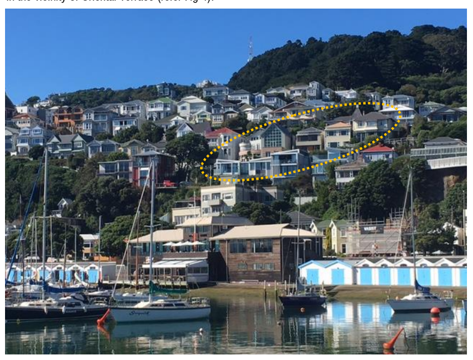
Fig 3: View from the southern end of Clyde Quay Wharf (McFarlane Street cluster of sites outside the character precinct)

Sites within the identified clusters are more likely to be redeveloped as they are not subject to demolition restrictions as those in the character precinct are. Ensuring that the scale of development on those highly prominent sites is consistent with the scale of development on sites within the character precinct is important if the integrity of the precinct and associated townscape values are to be maintained. This has been acknowledged by and reflected in the draft provisions - an approach that is justified on townscape character grounds, but noting that it deviates from the approach taken to the management of sites outside identified character precincts elsewhere in Mt Victoria where a higher level of intensification would be enabled.