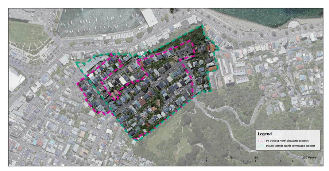
Fig 9: Wellington Draft District Plan: Mt Victoria North Townscape Precinct & Mt Victoria North Character Precinct

Mt Victoria North Character Precinct - the DDP identifies several Character Precincts (Mt Victoria Character Precinct being one those, refer Fig 10). Comprised of a range of older houses that are reflective of the historical development pattern of the City, the character precincts were identified based on the predominance of buildings constructed prior to 1930 and their contribution to the broader streetscape.