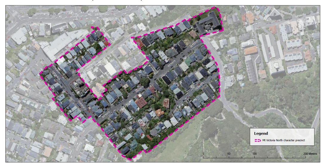
Fig 10: Wellington Draft District Plan: Mt Victoria North Character Precinct