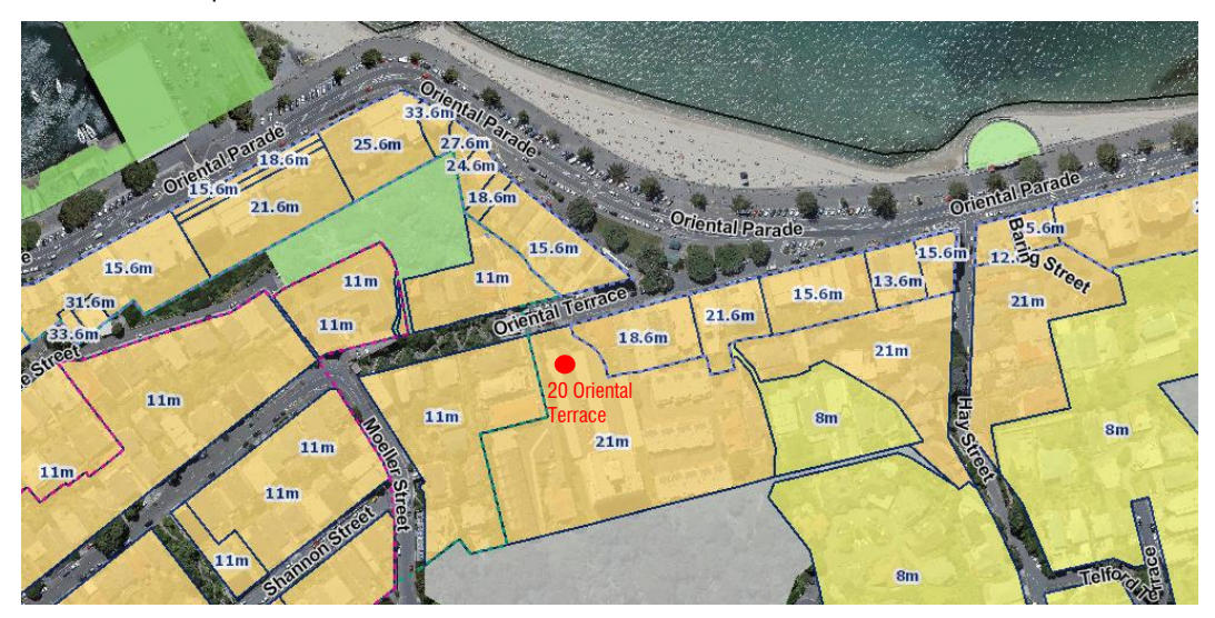
Fig 5: DDP Height Map (20 Oriental Terrace draft height 21m)

The sites immediately adjacent to the eastern boundary of the townscape precinct (on the southern side of Oriental Terrace) have a height limit of 21m - refer Fig 5. This could result in a new 21m tall building built close to the street boundary within the front part of 20 Oriental Terrace (Jerningham Apartments occupy the rear part of the site). Such a building could potentially impact on the townscape setting of the Monastery in views from the east by changing the foreground of the view. To reduce the likelihood of such an impact, consideration could be given to reducing the height limit for the front part of the site at 20 Oriental Terrace.