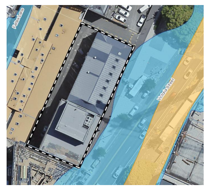
Figure 3. Excerpt from WCC PDP Planning Maps showing 154 Victoria Street and the Flood Hazard – Inundation Overlay (blue) and Overland Flowpath (orange).

194. In response to Singvest Group Limited [129.1] opposition to the Flood Hazard – Inundation Overlay applying to 154 Victoria Street, I have checked the Flood Hazard – Inundation Overlay and confirm that it does not apply to 154 Victoria Street, Te Aro as illustrated in Figure 3. Consequently, I do not agree with any amendments to the flood hazard overlay in response to this submission.