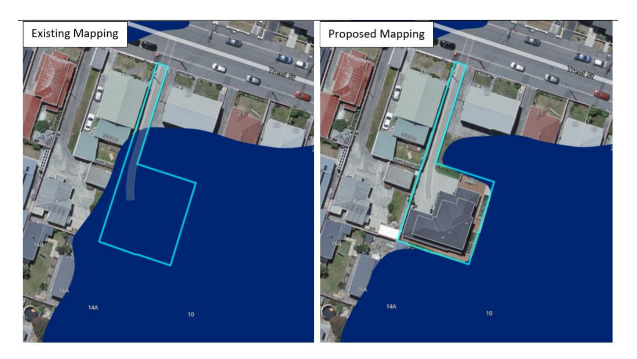
Figure 2. Representation of Wellington Water Flood Hazard mapping - 22B Glenside Road including the recommended change to the Flood Hazard – Inundation Overlay

194. In response to Singvest Group Limited [129.1] opposition to the Flood Hazard – Inundation Overlay applying to 154 Victoria Street, I have checked the Flood Hazard – Inundation Overlay and confirm that it does not apply to 154 Victoria Street, Te Aro as illustrated in Figure 3. Consequently, I do not agree with any amendments to the flood hazard overlay in response to this submission.