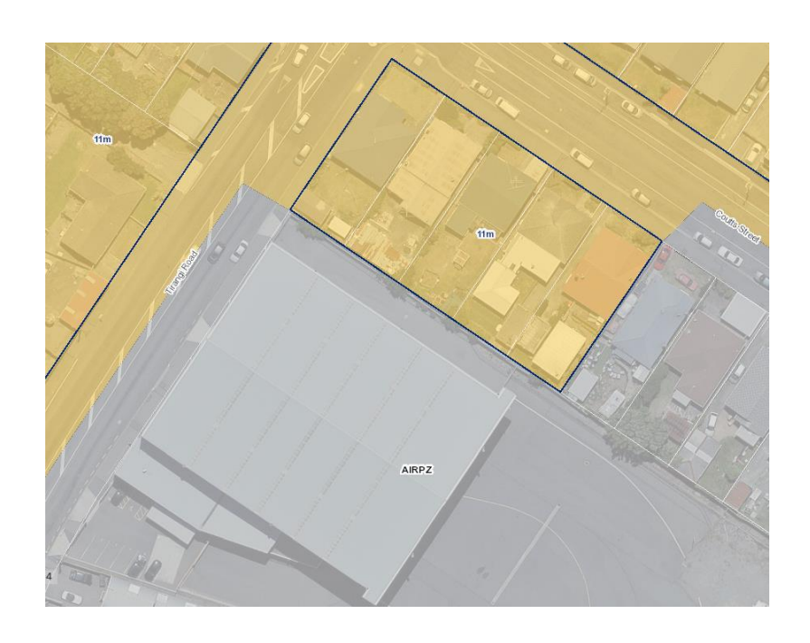
Figure 3: Residential Zone boarding Airport Zone