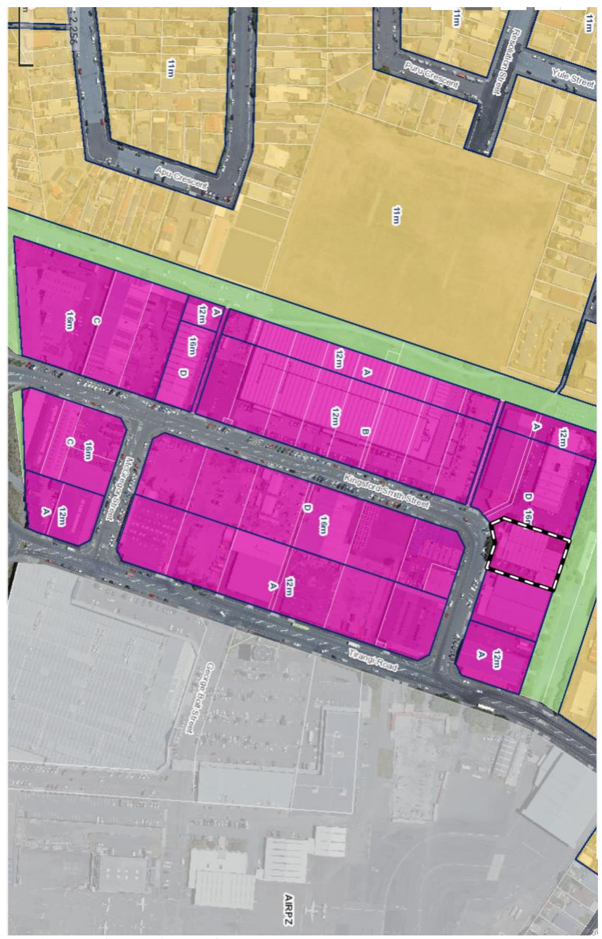
Figure 1: Zones and Area in relation to submission