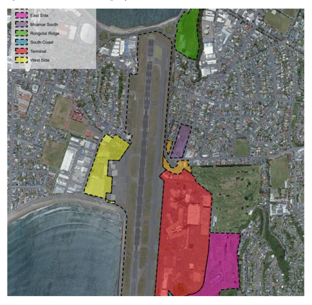
Figure 4: Airport Zone Precincts