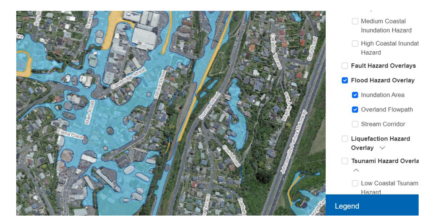
Figure 3 – Screen capture of Tawa from the Wellington City Proposed District plan GIS viewer, blue is the inundation area.

6.19 The application of the TCZ at the intersection of Cambridge Street and Main Street would also enable a greater range of activities and design responses at this main intersection that leads to the centre of Tawa to the east and the train station and to a larger residential catchment to the west accessed from Lyndhurst Road as a central location of this community. This would provide a much better outcome than the existing three garages at the south eastern corner for example (refer Figure 4 ).