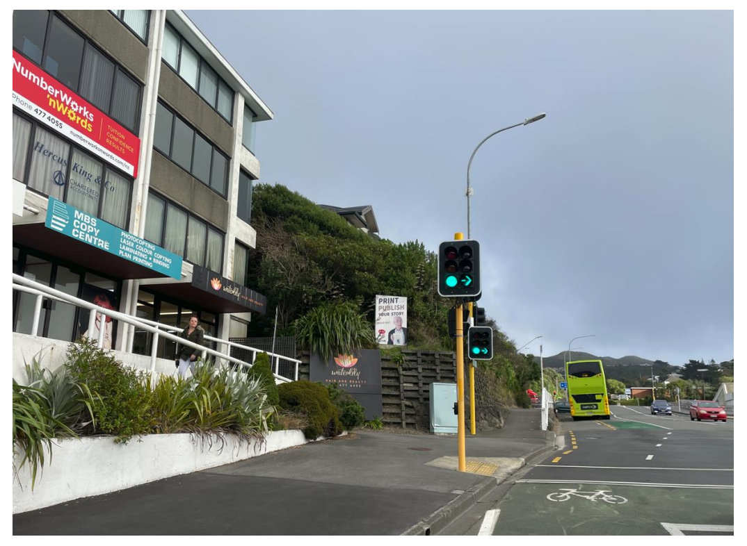
Figure 6 – View along Broderick Road looking west illustrating tallest part of retaining structure where an active frontage is recommended.