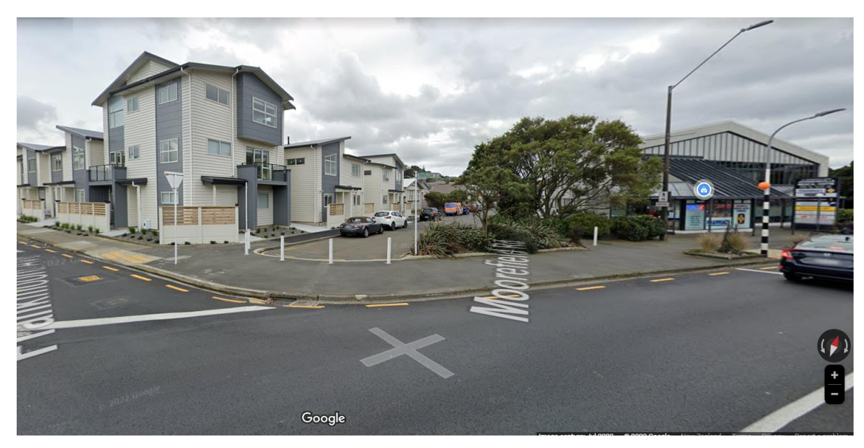
Figure 5 - Google Streetview photo from Moorefield Road looking to the recent three storey dwelling on the corner of Frankmoore Avenue and Trafalgar Street.

residential development is viewed from Moorefield Road with the Countdown supermarket behind the camera position. The residential development is flanked on both sides by the MCZ. The development has a poor interaction with the street and does not provide a good outcome in terms of the contribution it has to the quality of the centre.