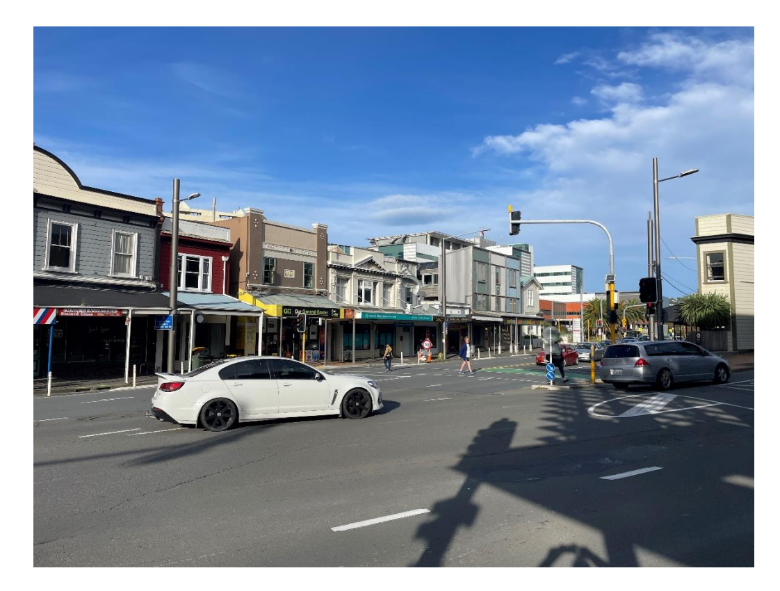
Figure 8 – Photograph taken from the corner of John Street and Adelaide Road looking south east with heritage area buildings in the foreground and the hospital behind.