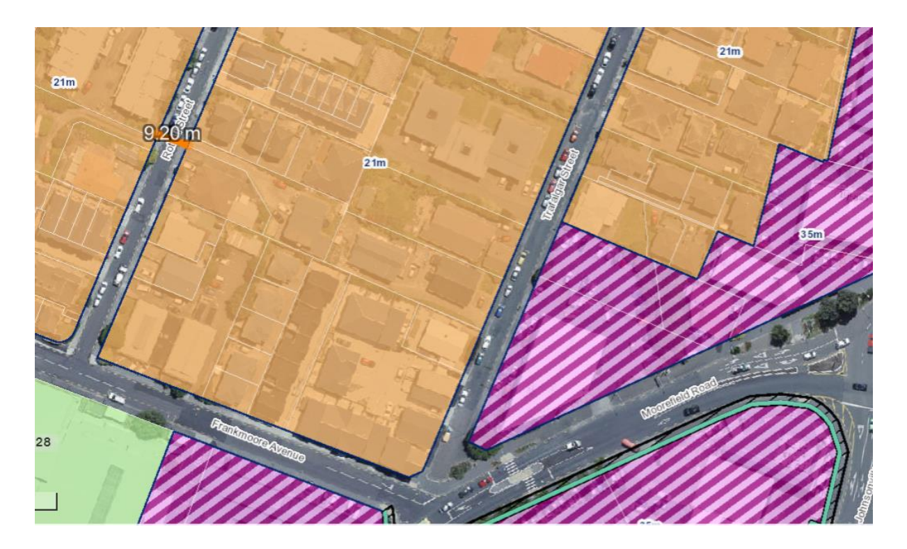
Figure 7 – Screen capture of the notified Plan identifying narrow streets in Johnsonville.

6.54 The notified zoning is illustrated in Figure 6 for ease of reference, with 21m and 35m heights proposed along the length of these two streets. Frankmoore Street is 12m wide. Council must have considered both streets as being suitable for at least part of their length to be zoned MCZ with HRZ opposite. This compares with Burgess Road at 10m wide, Gothic Street at 12m wide, (both with MCZ applying either side) and central city examples of Lorne Street at 10.7m wide, College Street and Vivian Street at 15.2m wide, and Barker Street at 12.2m wide, where the CCZ applies either side with unlimited height opportunity. High Street and O'Connell Street in Auckland central city are approximately 10m wide.