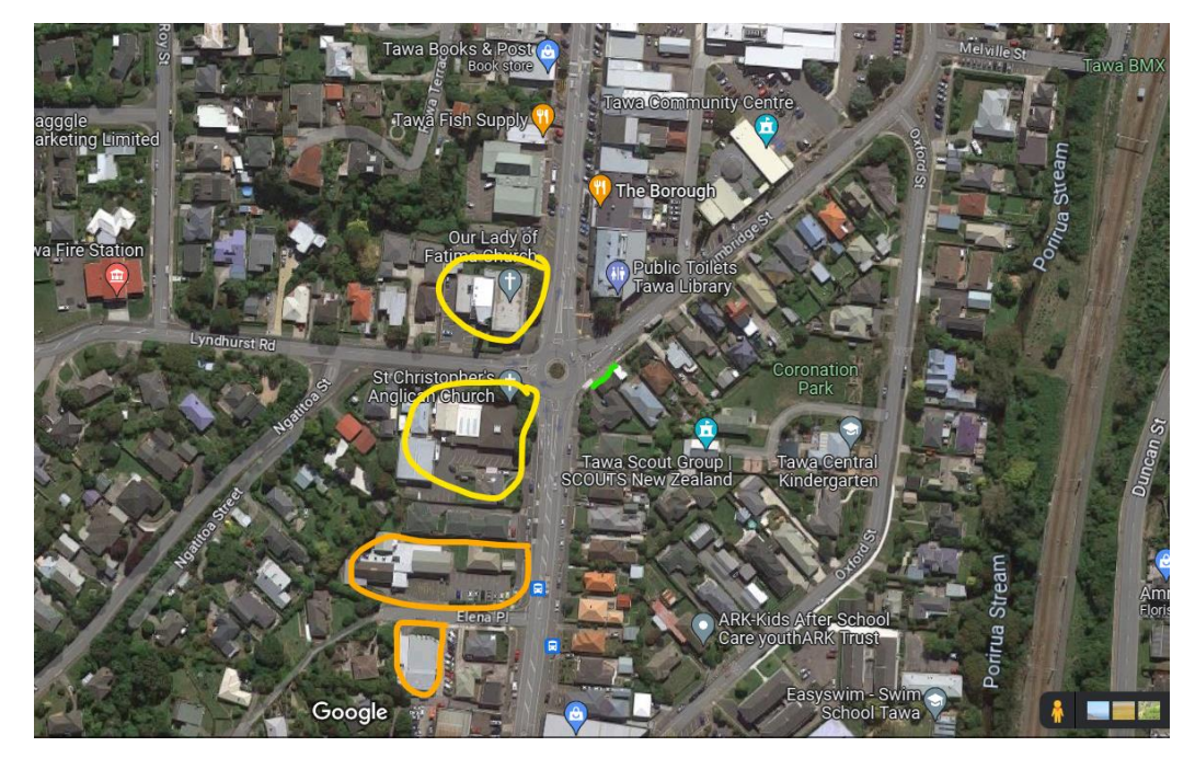
Figure 1: Intersection of Lyndhurst Road, Cambridge Street and Main Road in Tawa. Yellow circles indicate the location Our Lady of Fatima and St Christopher's Anglican Churches, orange circles indicate the location of Tawa Union Church and Gospel Hall; green line indicates the location of garages, affecting active frontage.