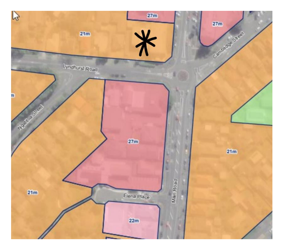
Figure 2 – Section 42A report recommended zones in Tawa and church site identified with asterisk.<sup>17</sup>

reason provided in the Section 42A or Section 32 reports as to why this church site is not zoned centre whereas the site opposite is.