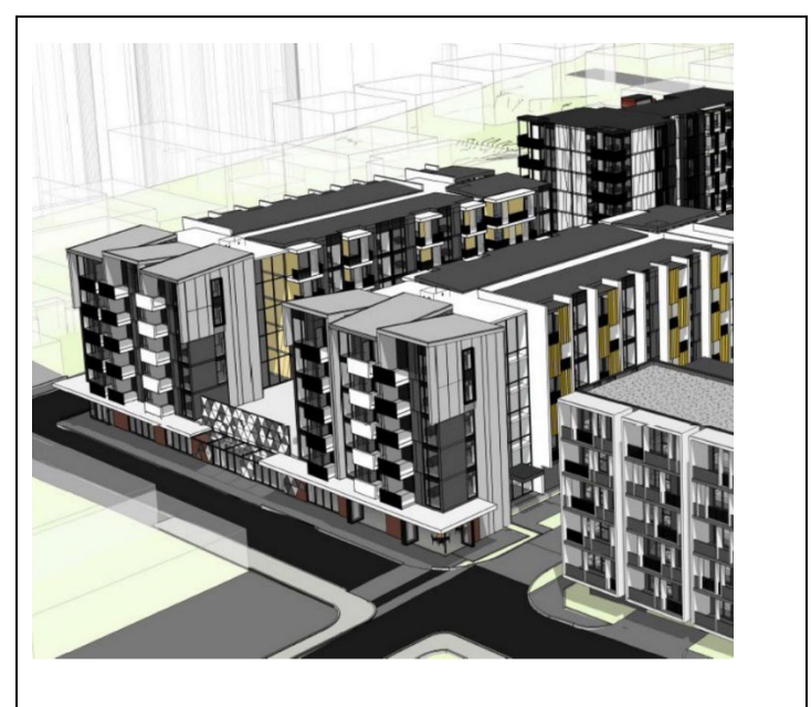
Figure 8 Arlington developments showing wind screen needed for ODP compliance between two towers

18.9 The recent wind tunnel tests of the Arlington Street Kainga Ora apartments demonstrate that, with few neighbouring buildings providing shelter, an 11-14m tall building can cause problematic issues at street level.