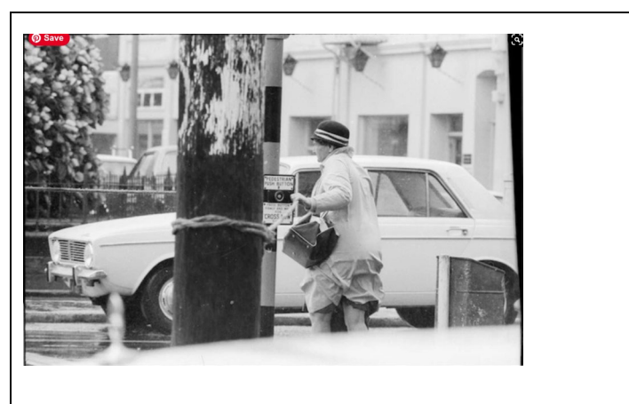
Figure 1 Battling strong wind at the Taranaki Street (Hope Gibbons) intersection, Wellington. Using a rope handhold tied to a nearby pole. Photographed by an Evening Post staff photographer 28 August 1970

16.1 Experience of wind tunnel tests of buildings in the Te Aro area that are significantly taller than their surroundings (e.g. Il Casino development circa 2008 at 27m) suggests that buildings of the height now to be approved in the MRZ and the HRZ will likely have the type of effect that enhanced Wellington's windy reputation after construction of the 1925 Hope Gibbons Building (Figure 1 - 30m).