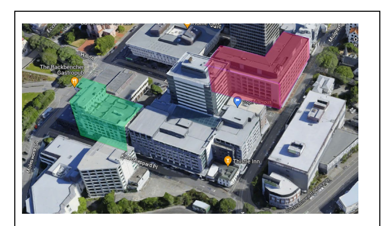
Figure 2 Wind Tunnel Tested Developments in Thorndon (Pink) now demolished Defence Building; (Green) Kate Sheppard Apartments