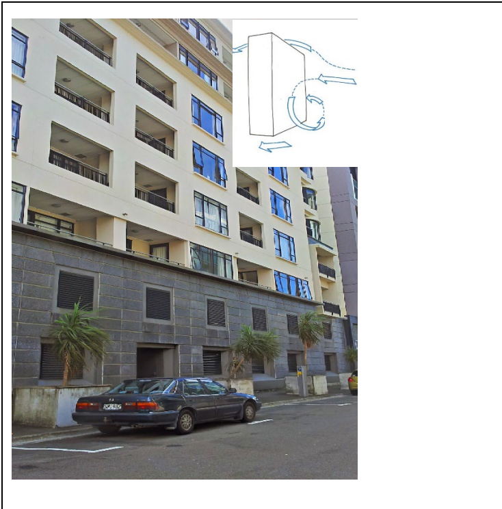
Figure 3 Trees replace verandah on the front face of Kate Sheppard Apartments

16.5 In the 1970s French researchers systematically tested buildings of varying shape, form and height. Their book about this research (Gandemer and Guyot 1981) is the basis for the PDP's wind design guidance document. They identified that there are accelerations due to the wind being diverted around a building – leading to what they designate the "corner effect". This is first of all an unavoidable effect of a building of any scale. However, their research pointed out that as buildings become taller, the height makes the corner accelerations more extreme. However, as reported in the wind design guidance, buildings shorter than 15m in height are unlikely to experience downwash acceleration (Figure 4).