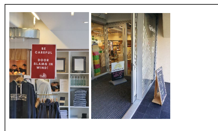
Figure 9 Pre-prepared signs for windy days at the bookshop entry to the Easterfield building, te Herenga Waka, Kelburn Parade

However, my personal experience is that the tall buildings owned by the university have had historic wind safety issues on site for at least 5 decades. The Kelburn campus, for example, sits on a ridge exposed to winds from all directions. The effects of the Kirk and Easterfield buildings, for example have been reduced over time as the University has constructed wind shelter measures such as the "Hub". The huge wind sheltering entry to the Easterfield building was created on campus to minimise the potential safety issues arising from the transition from indoors through this high wind zone when exiting from the building.