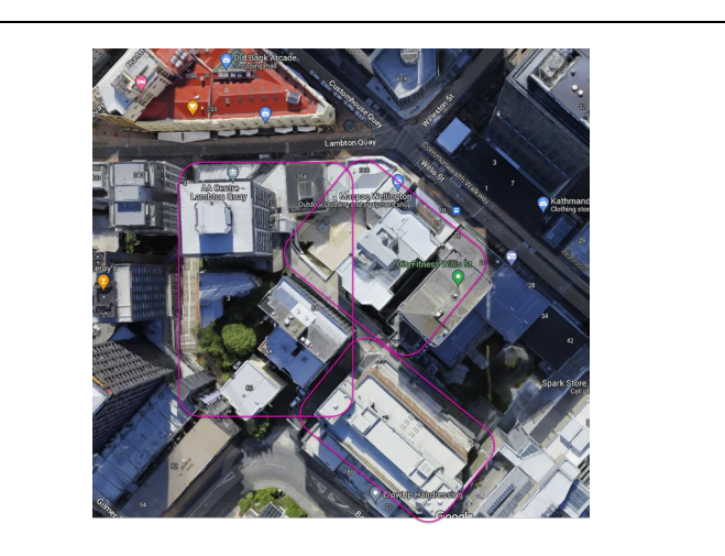
Figure 5 Map highlighting the areas where new buildings were planned at the same time in the early 1980s

17.3 Ultimately the goal was, and remains, to ensure the amenity value that the next building in the area cannot be built as the wind speeds are so close to the safety limit. In the process we also work towards the goal of incremental improvement in the general windiness of the city.