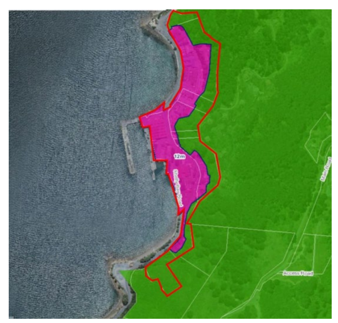
PDP Zoning - Shelly Bay with the extension proposed by Taranaki Whānui in red

40. Michelle Rush [436.5, 436.17] considers the extent of MUZs should be extended in and around the NCZ, MDRZ, HDRZ and LCZ. The submitter notes this would enable the ability for people to work, live, and seek services within a walkable, or micro-transport catchment while achieving carbon reduction, increasing liveability and amenity, contributing to public health and wellbeing, and community vibrancy.