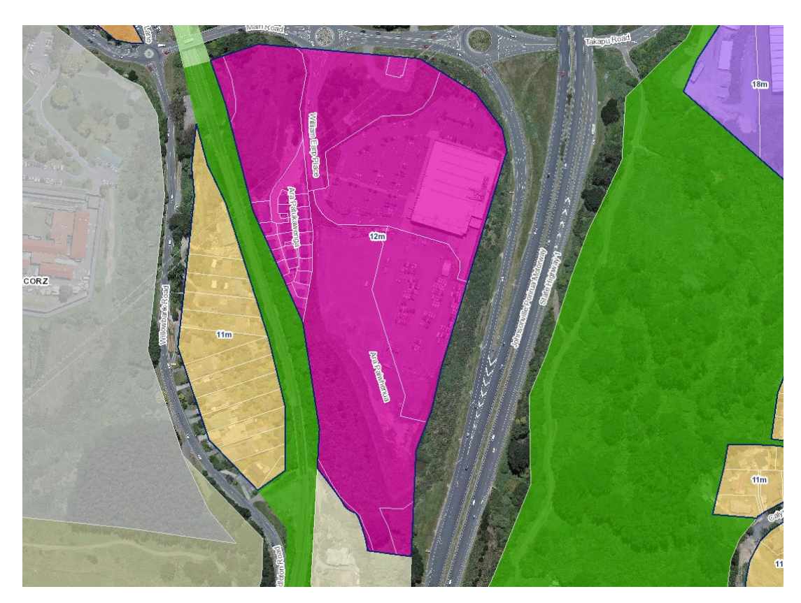
PDP Zoning - Takapu Island