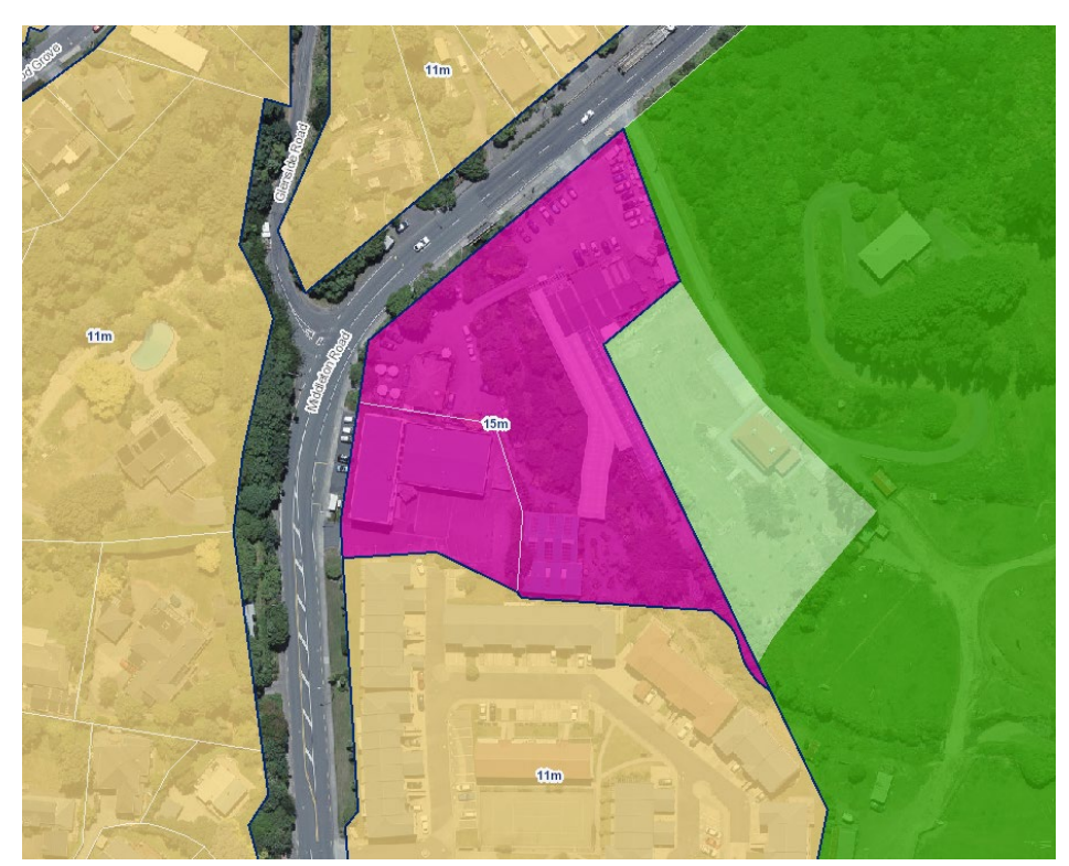
PDP Zoning - 236-238 Middleton Road

202. Rongotai Investments Limited [269.1] considers the Rongotai South MUZ height control limits to be inconsistent with the surrounding area and seeks to increase the Rongotai South MUZ Height Control A, B, C and D limits to 20 metres. The MUZ referred to in the submission is shown below: