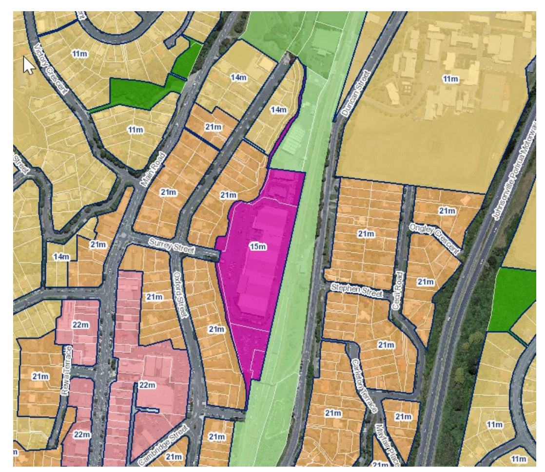
PDP Zoning – 10 Surrey Street, Tawa (Tawa Junction)