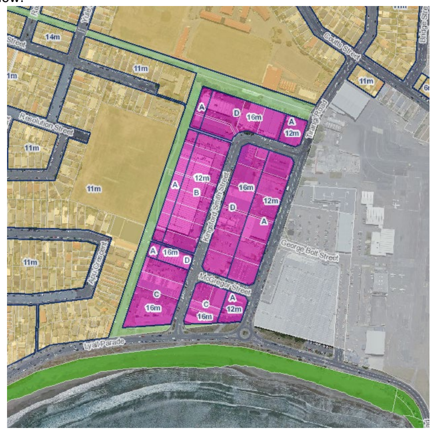
PDP Zoning – Rongotai South

202. Rongotai Investments Limited [269.1] considers the Rongotai South MUZ height control limits to be inconsistent with the surrounding area and seeks to increase the Rongotai South MUZ Height Control A, B, C and D limits to 20 metres. The MUZ referred to in the submission is shown below: