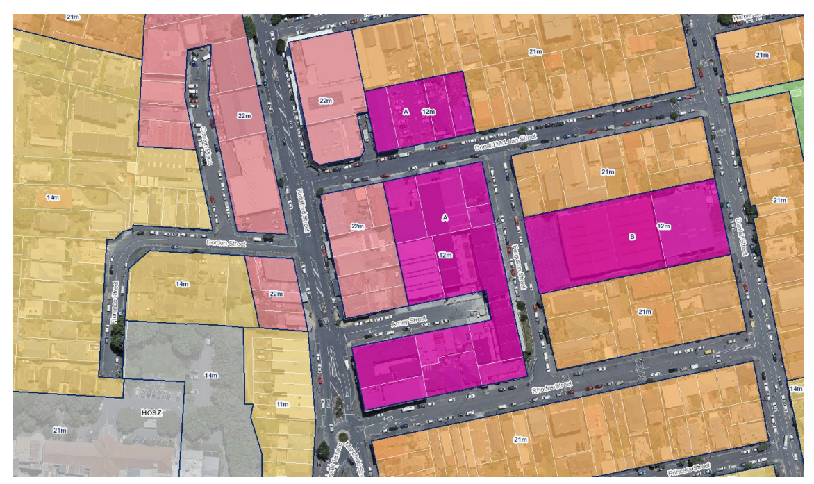
PDP Zoning – Newtown