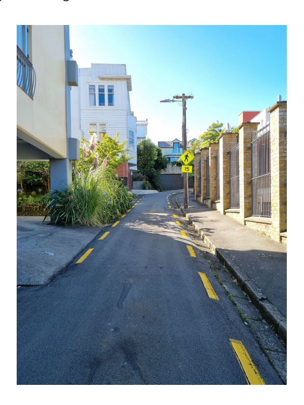
Figure 1: Photograph from the bottom of Selwyn Terrace, showing narrow vehicular and pedestrian access (taken 18 March 2023)