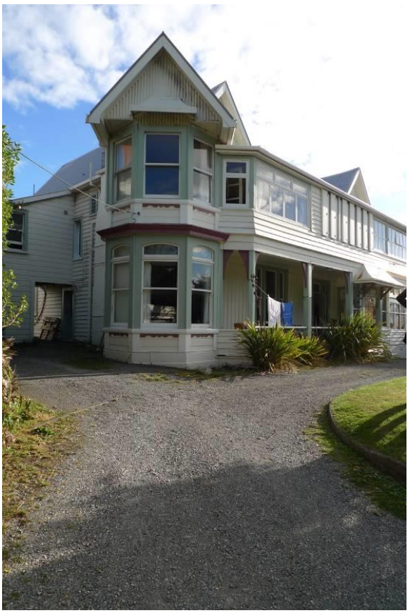
Main entrance, north west elevation, R Murray, 2010.