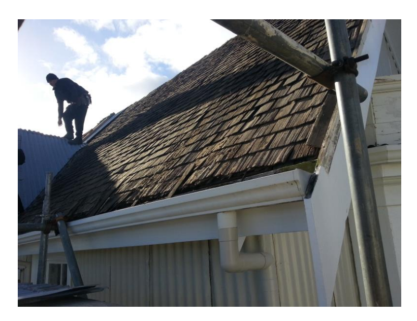
Early shingle tiles under corrugated iron, N Naus, 2013