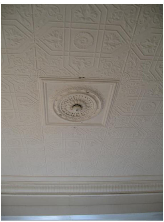
Pressed tin ceiling, Archbishop's room, J Newman, 2008.