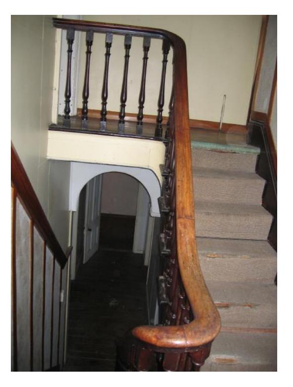
Servants' staircase, J Newman, 2008