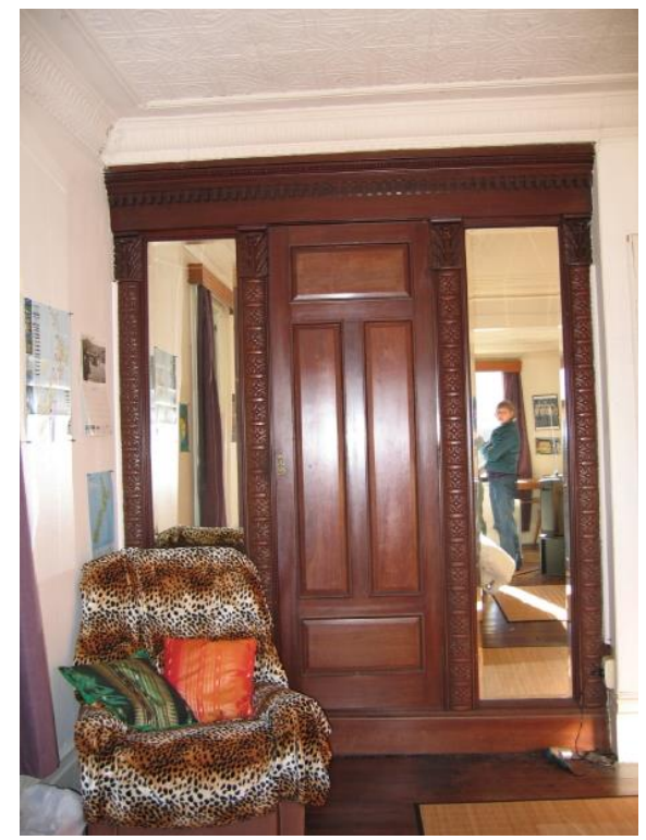
Vestments warbrobe, Archbishop's room, J Newman, 2008.