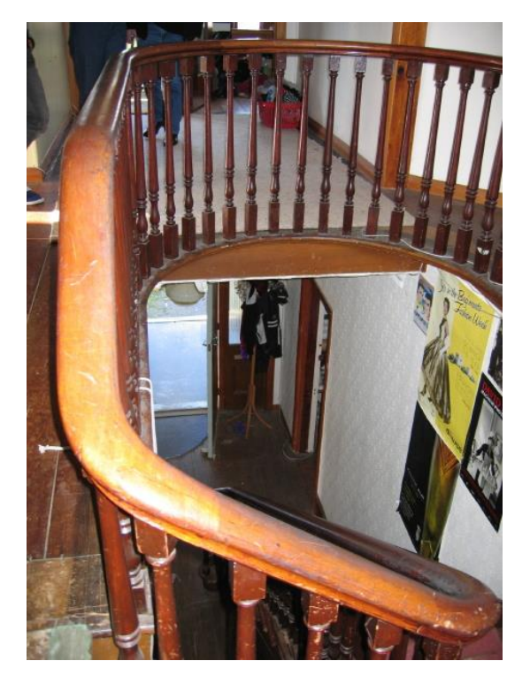
Main staircase, J Newman, 2008