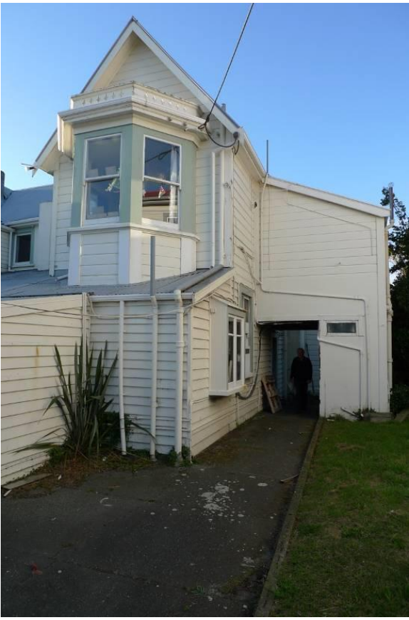
Rear pedestrian entrance, south elevation, R Murray, 2010.