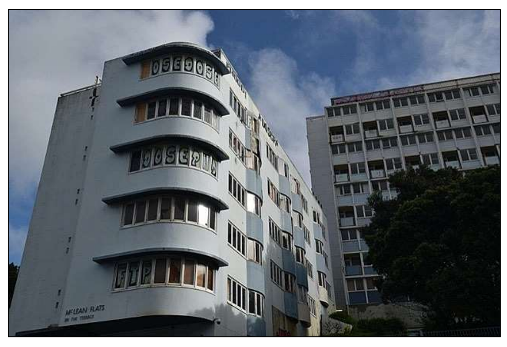
McLean Flats and Gordon Wilson Flats, Wellington. Mclean Flats