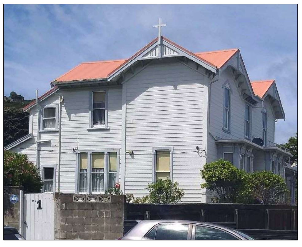
Hurston, Island Bay, Wellington