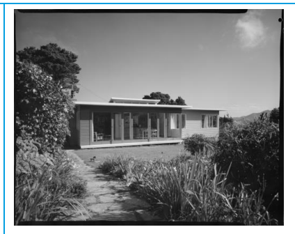
Photographed by John Ashton, 1962. ATL: 1/2-199941-F.

HNZPT Category I Historic Place, WCC DP Heritage Building