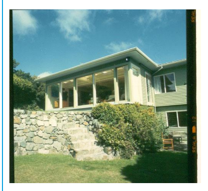
date unknown.