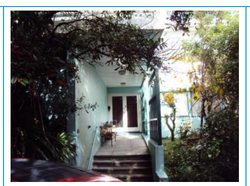
Lower entrance to Hirschfeld House, 2011.

49 Waiapu HNZPT Category Road, Kelburn I Historic Place