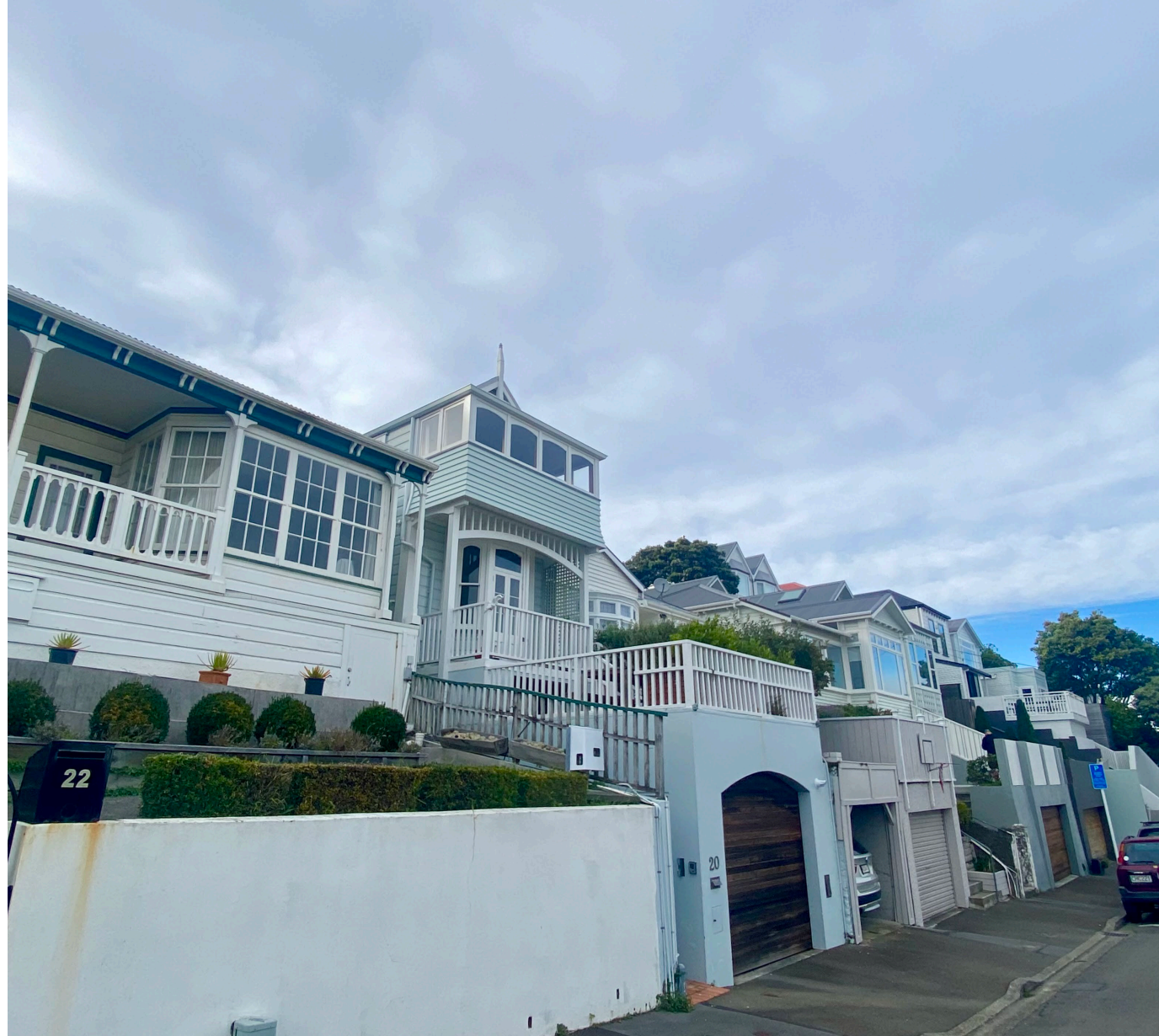
Earl's Terrace consists largely of original houses built in the C19