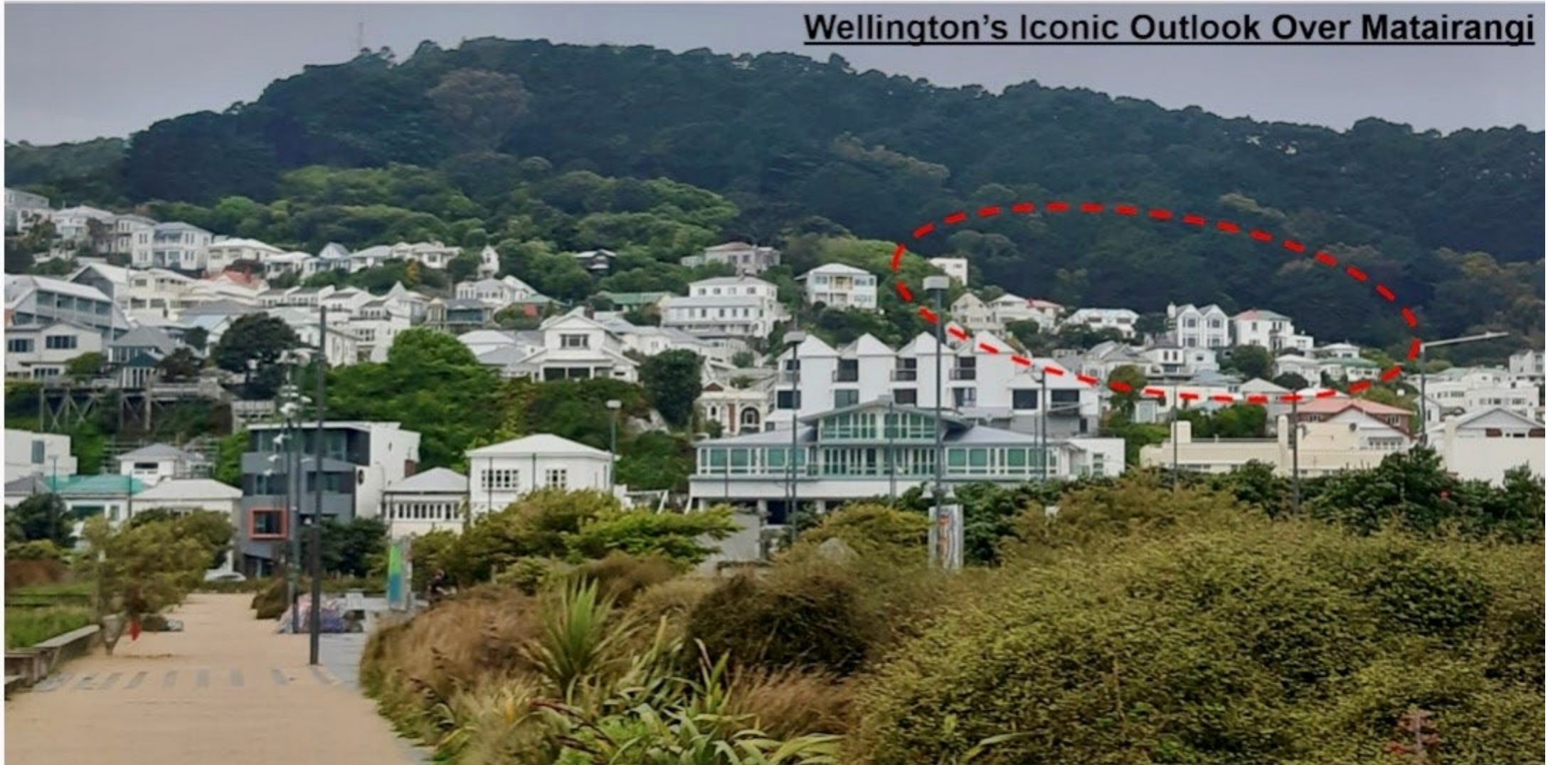
Stafford St & Earls Tce, Mount Victoria From Waitangi Park