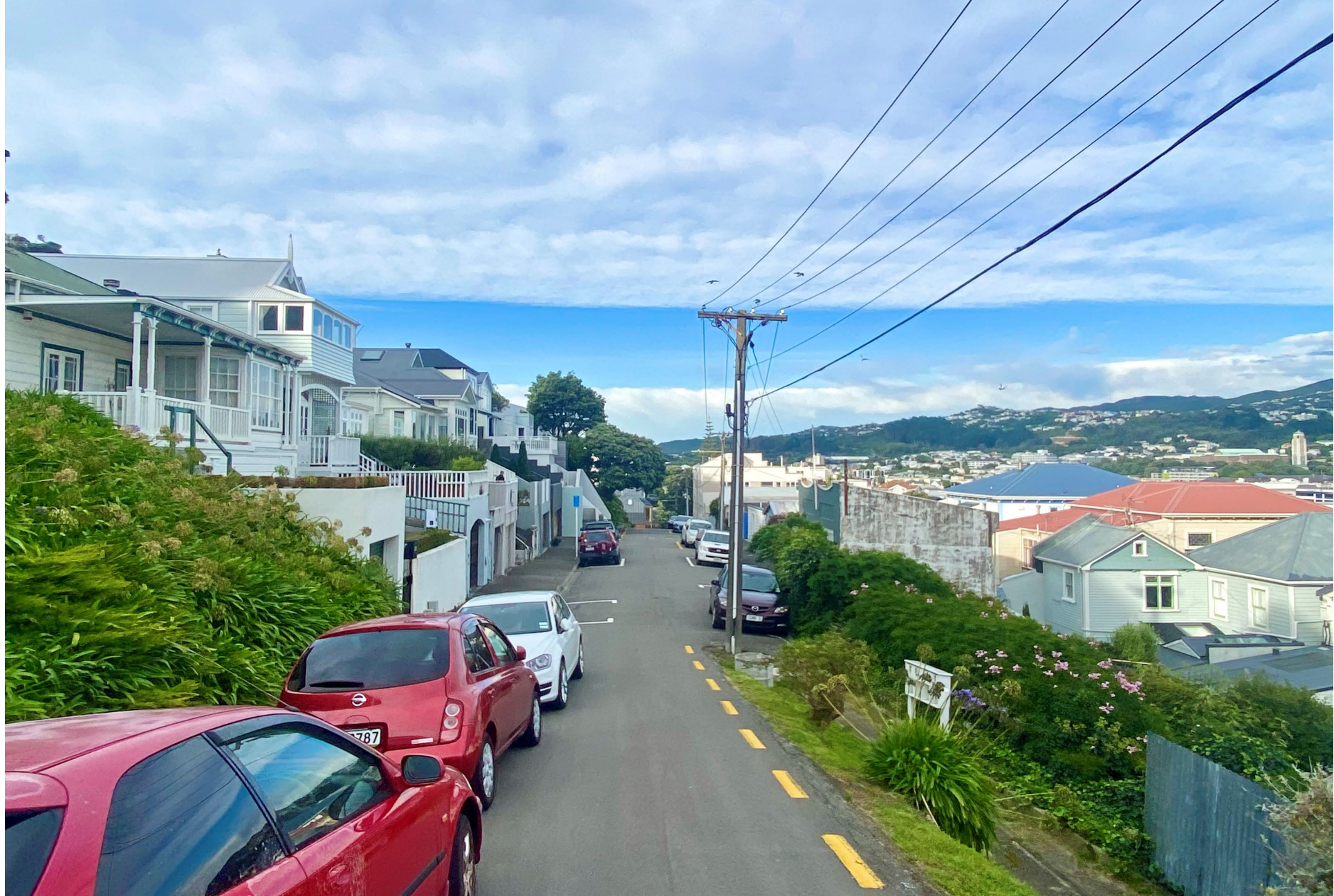
Very narrow Earl's Terrace, 17 th steepest street in Wellington