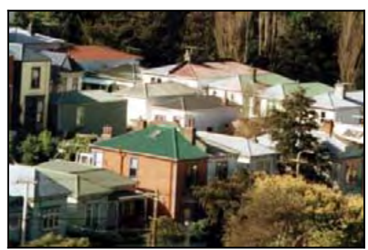
Cluster development roofscape suggested

<u>development</u> would contrast and be uncharacteristic. However, the concentration and orthogonal alignment of individual dwellings on separate small lots located very closely to each other on the flatter parts of the area suggests a form of cluster development.