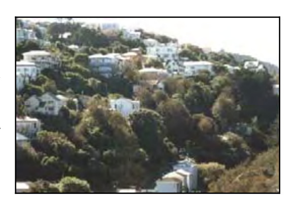
Dominance of planting on steep sites