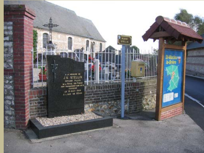
Place Stellin St Maclou La Briere 2006