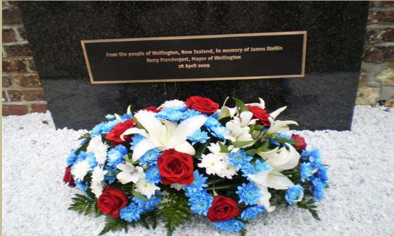
Mayor Prendergast visit to St Maclou La Briere April 2009