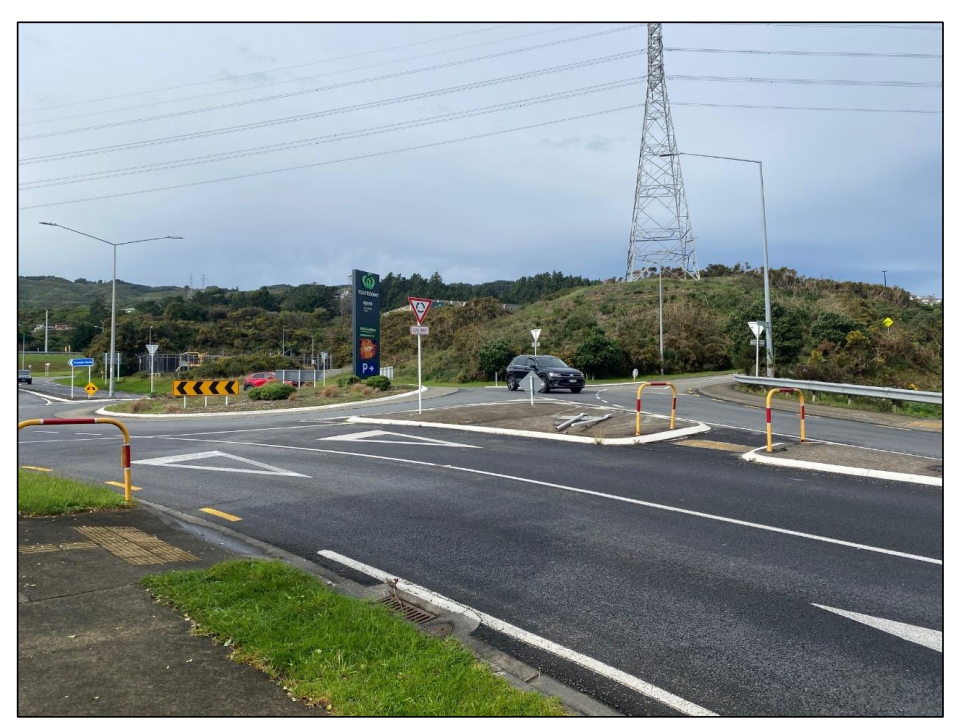
Figure 3: Sign knocked down following an accident on the pedestrian refuge in May 2023