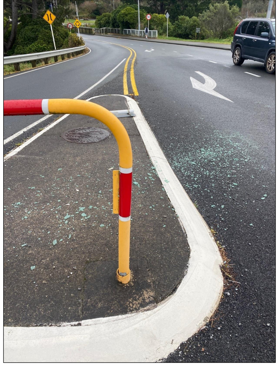
Figure 5: Smashed glass following an accident on or about July 23<sup>rd</sup> 2023.