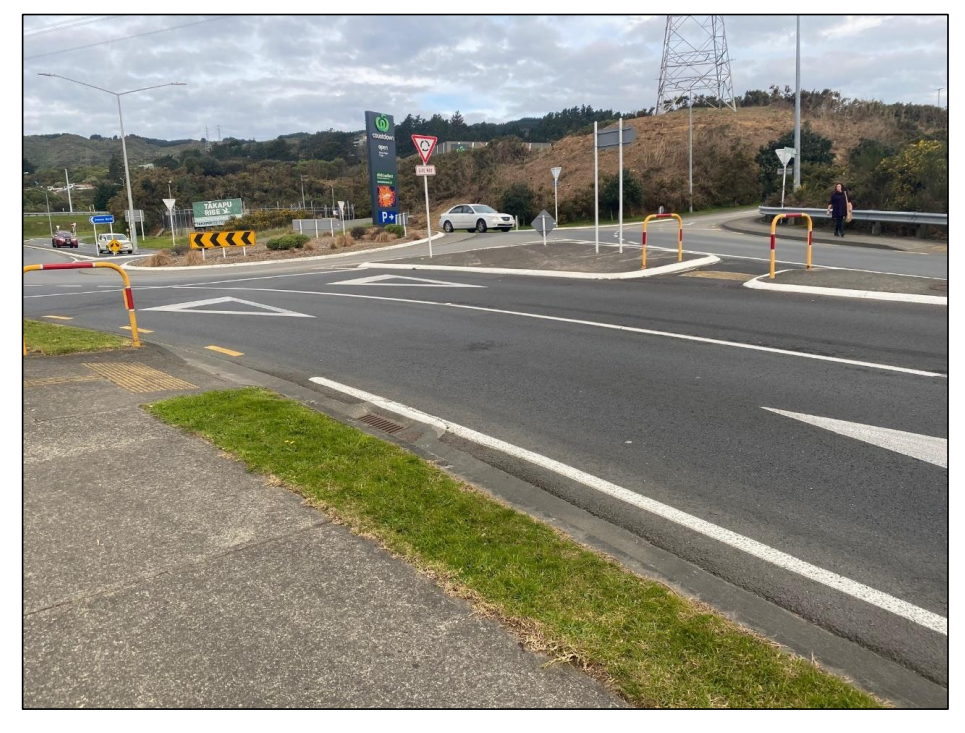
Figure 2: The key pedestrian crossing on Takapu Road of concern