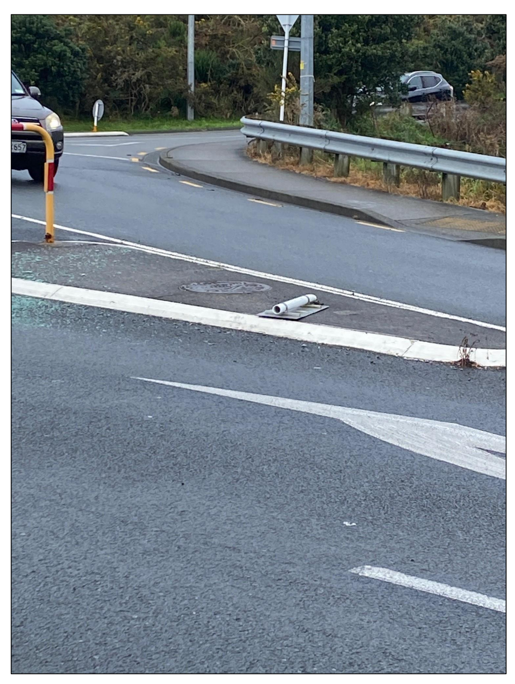
Figure 6: Another sign knocked down following an accident on or about July 23rd 2023