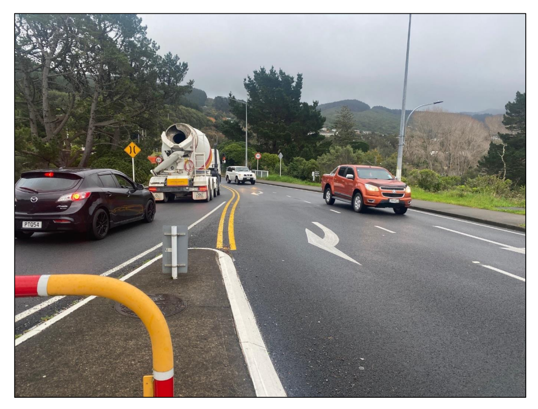
Figure 7: No visibility of oncoming vehicles at peak traffic times