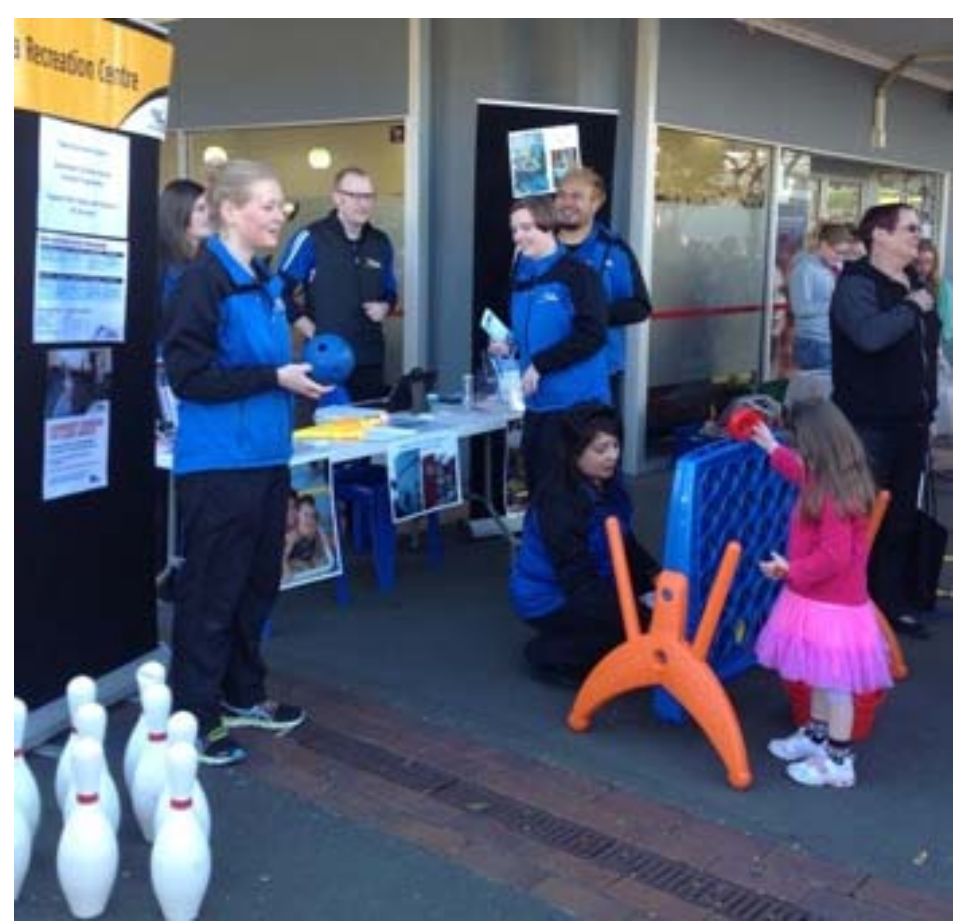
Tawa Pool and Recreation Centre stall "Spring into Tawa".