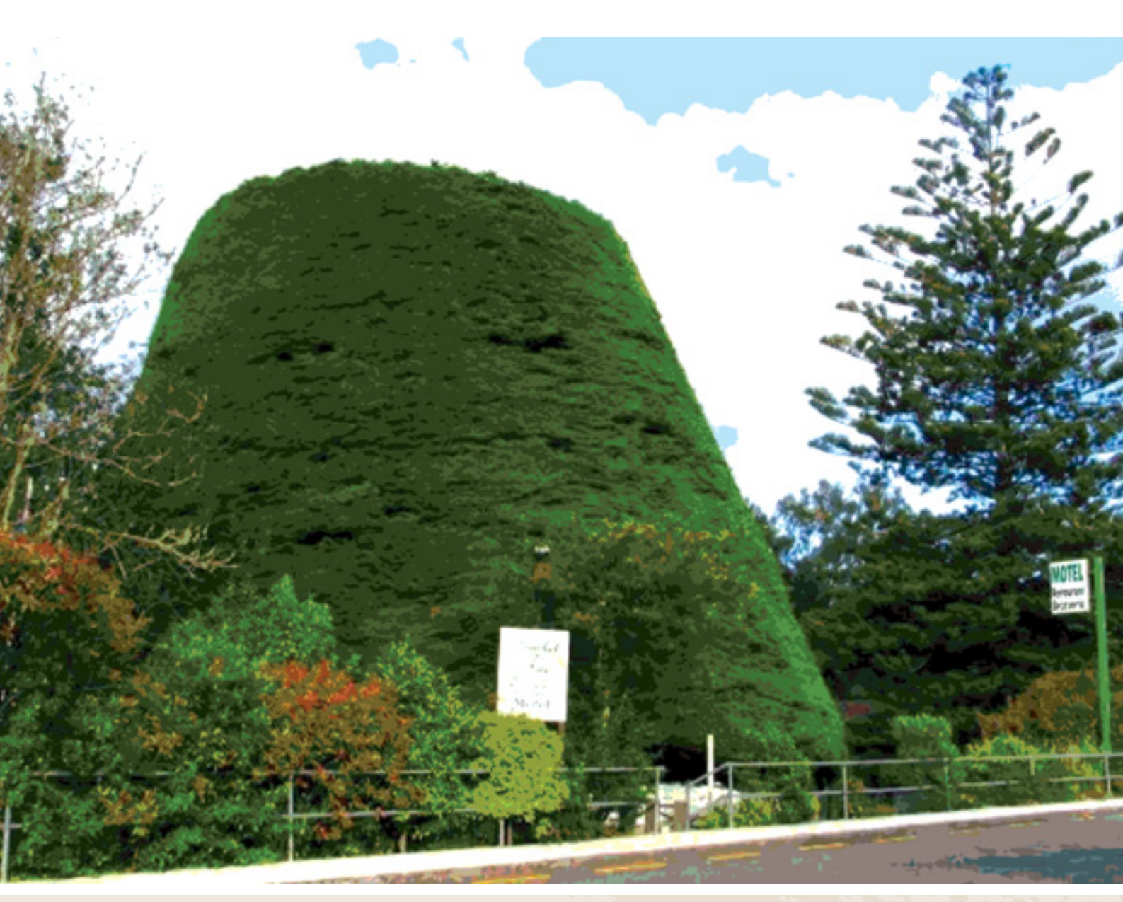
Bucket Tree, 1 Boscobel Lane, Tawa