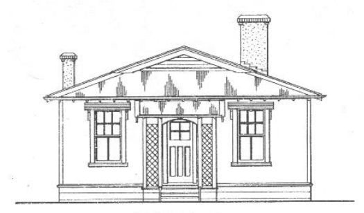
ROOF B, PORCH B