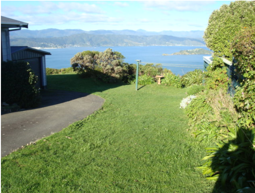
Flat area of land between nos 28 and 43 showing views and edge of regenerating bush

The detailed changes in District Plan zoning were outlined in the October 2009 SPC report – in summary: