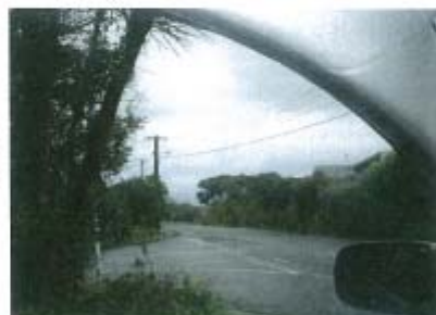
View showing sight line past tree to the left from drive way exit