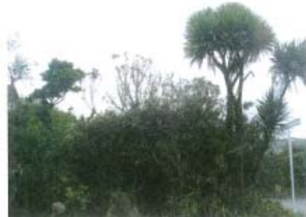
View of Sight Line – alternative angle showing cabbage tree and corner