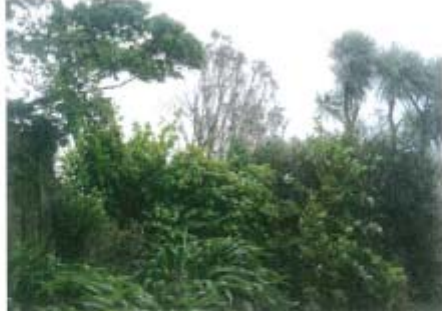
View of Sight Line showing fence for 30A Seatoun Heights Road on left