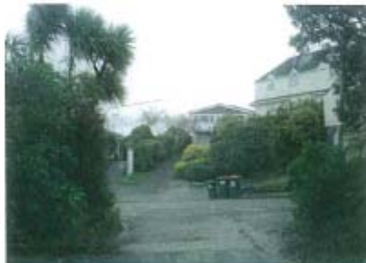
View as car approaches drive way exit

Although a driver might glimpse a car on Seatoun Heights Road approaching from the south through the Sight Line as you suggest, the driver will be required to pause where the drive way meets the road to carefully check for traffic coming from the right or along Townsend Road to the left, as well as pedestrians. The visual check through the Sight Line would not appear to be a reliable indication of what traffic might be approaching the intersection without also pausing at the exit of the drive way to check traffic coming from other directions. Once these checks are complete, a driver must also check for any traffic turning right out of the intersection before safely exiting the drive way (which is made possible given the clear view of the intersection from the end of the drive way as pictured below right). The Sight Line does not appear to offer any additional visibility when exiting the drive way.