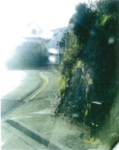
Photo taken from inside car

I attended at the site on 13 August 2012 and inspected the exit from Stormanstown Way onto Seatoun Heights Road – see the photo below.