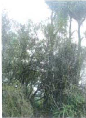
View showing Sight Line as seen from driver's seat in car

Although a driver might glimpse a car on Seatoun Heights Road approaching from the south through the Sight Line as you suggest, the driver will be required to pause where the drive way meets the road to carefully check for traffic coming from the right or along Townsend Road to the left, as well as pedestrians. The visual check through the Sight Line would not appear to be a reliable indication of what traffic might be approaching the intersection without also pausing at the exit of the drive way to check traffic coming from other directions. Once these checks are complete, a driver must also check for any traffic turning right out of the intersection before safely exiting the drive way (which is made possible given the clear view of the intersection from the end of the drive way as pictured below right). The Sight Line does not appear to offer any additional visibility when exiting the drive way.