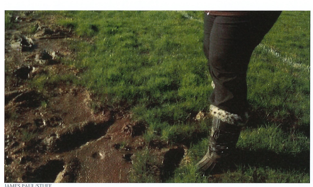
Games are often cancelled or transferred to other parks throughout Wellington, meaning many of Tawa's junior footballers have had very few home games.