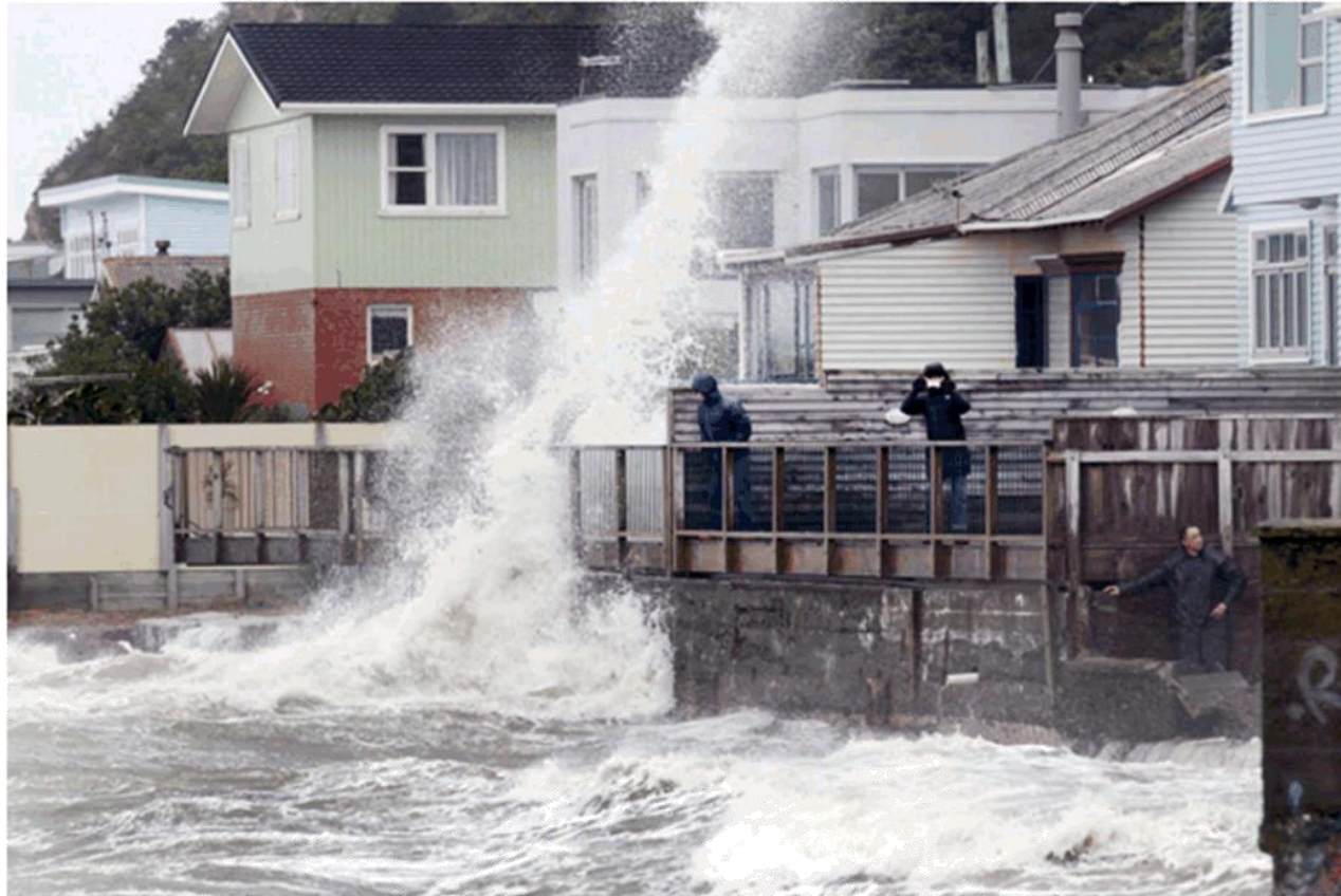
The June 2013 storm showed the vulnerability of Wellington's South Coast, including these Lyall Bay properties.

July 2013: http://www.stuff.co.nz/dominion-post/news/74458132/how-sea-level-rise-will-affect-the-wellington-region-and-possible-solutions