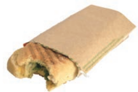
Vegetable wax coated paper

This is the only greaseproof paper which can be composted