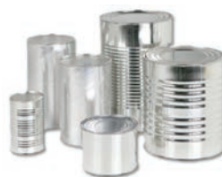
Tins & cans

Contact your local council for more information about which types can be accepted