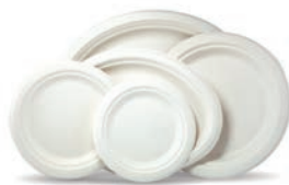
Sugarcane or Bagasse