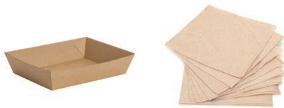
Unlined paper & cardboard

Materials accepted into the commercial compost include certified food packaging products made from: