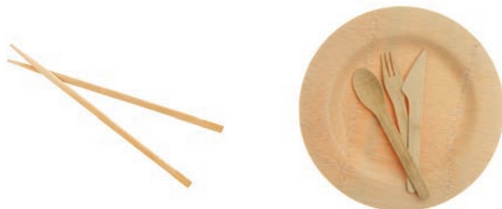
Soft/thin bamboo materials & cutlery