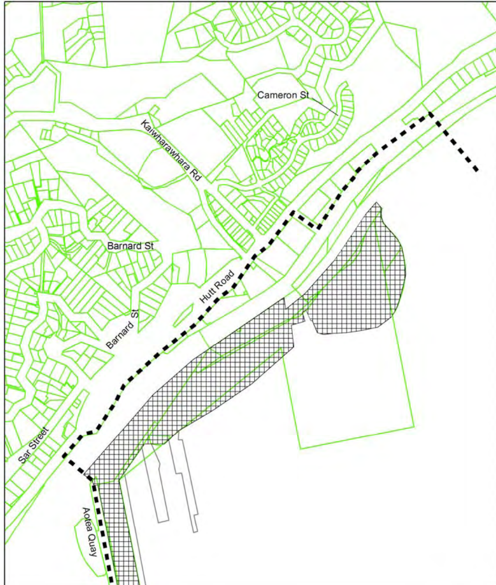
Map 1b - Main Port - Northern Area