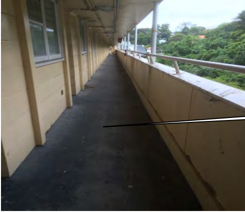
Landing membrane not Asbestos (22)

Sample 23 Outside cladding panel Balcony unit 415 (CES REPORT No 132378 Attached) Amosite and Chrysotile Asbestos detected.