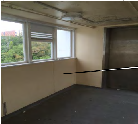
Sample 29 Wall panels lift lobby Top level (CES REPORT No 132384 Attached) Amosite and Chrysotile Asbestos detected.