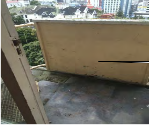
Exterior lining handrail not Asbestos (15)

Sample 16 Lining to shower unit 315. (CES REPORT No 132371 Attached) No Asbestos detected.