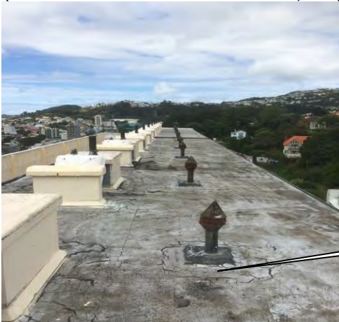
Sample 30 Upper Roof Membrane (CES REPORT No 132385 Attached) Chrysotile Asbestos detected.

Asbestos content in roofing membrane (30)