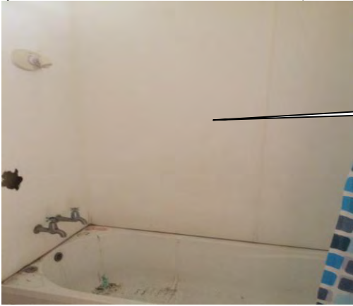
Shower linings no Asbestos backed (16)

Sample 16 Lining to shower unit 315. (CES REPORT No 132371 Attached) No Asbestos detected.