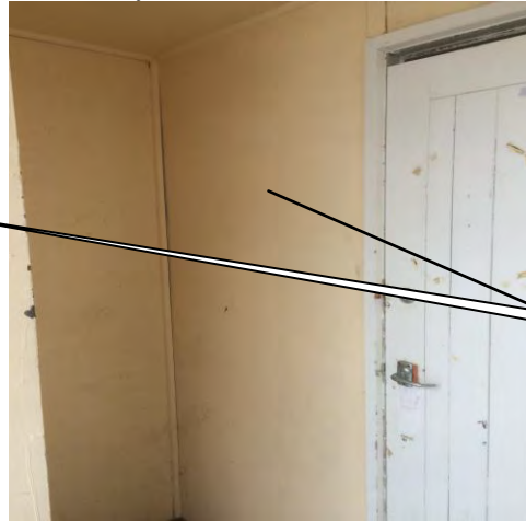
Asbestos cladding (26)

Hazard algorithm score 5(low) while not disturbed