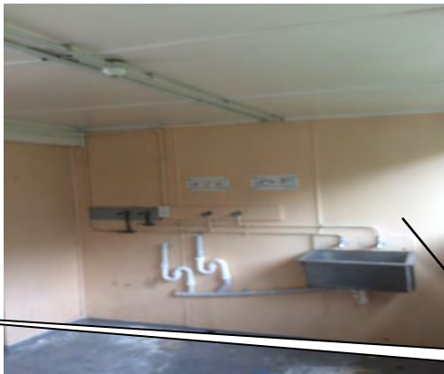
Asbestos cladding (27)

Hazard algorithm score 5(low) while not disturbed