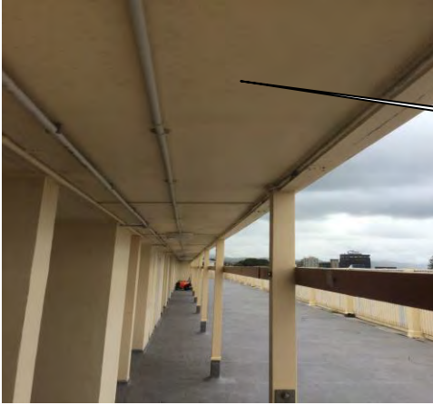
Asbestos soffits (25)

Hazard algorithm score 5(low) while not disturbed