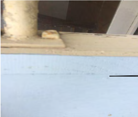
Asbestos cladding (23)

Sample 23 Outside cladding panel Balcony unit 415 (CES REPORT No 132378 Attached) Amosite and Chrysotile Asbestos detected.