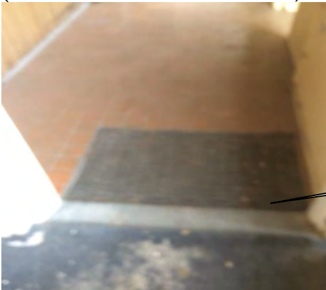
Backing paper not Asbestos (24)

Sample 24 Backing paper under new Vinyl unit 415 (CES REPORT No 132379 Attached) No Asbestos detected.