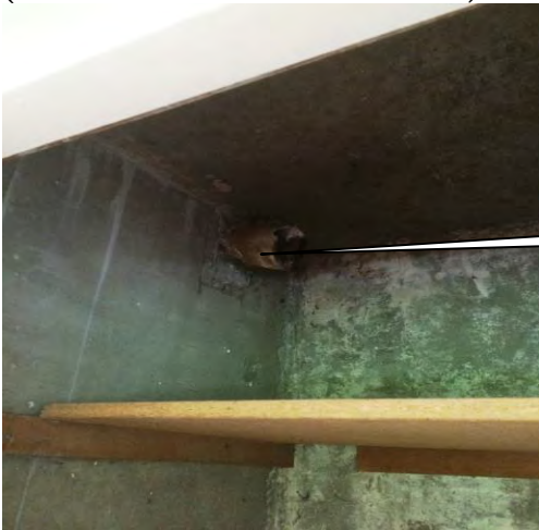
Asbestos vent pipe (17)

Sample 17 Pipe in hot water cupboard unit 315. (CES REPORT No 132372 Attached) Amosite Asbestos detected.