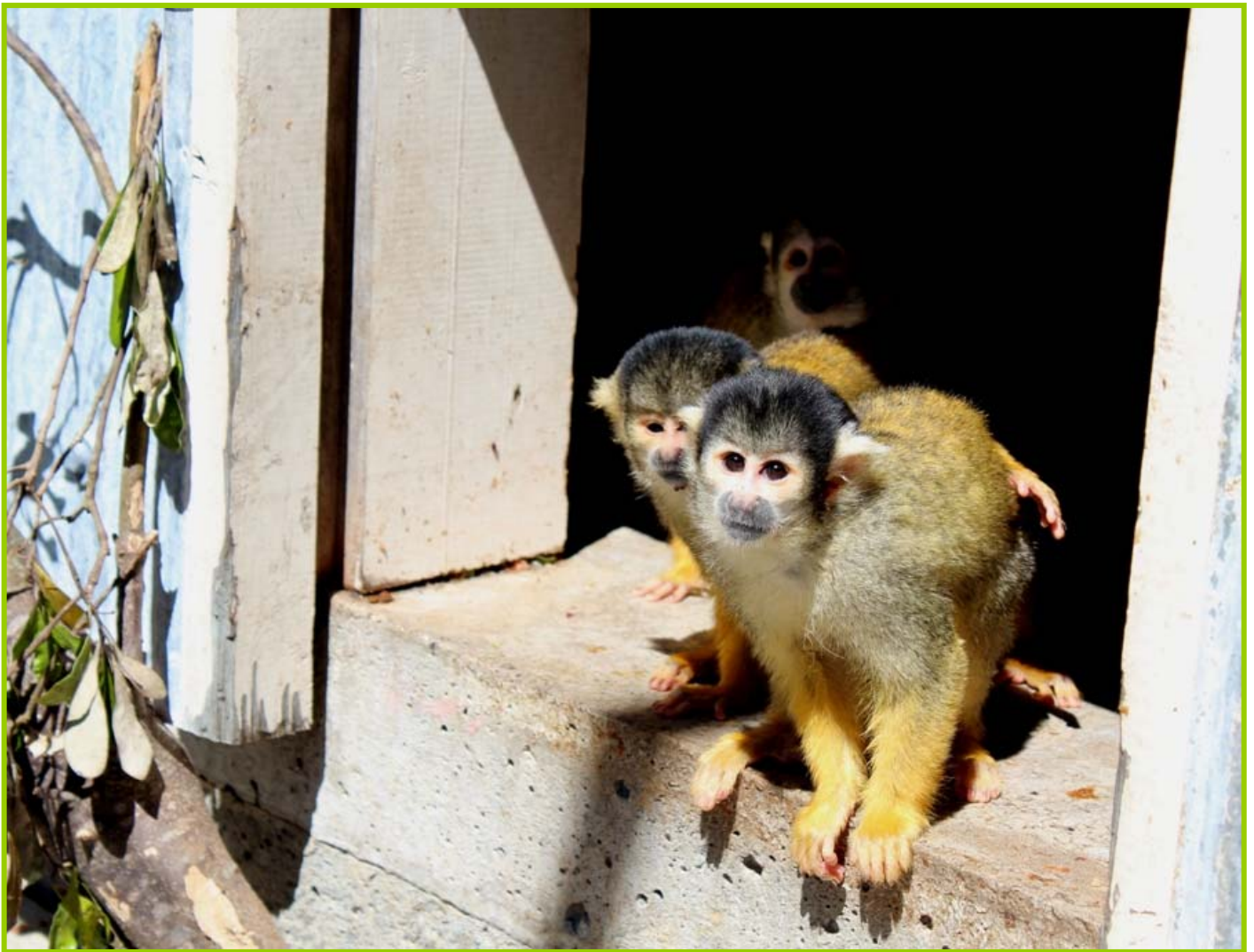
Two of our Squirrel Monkeys in their exhibit – arrived 10 February 2012