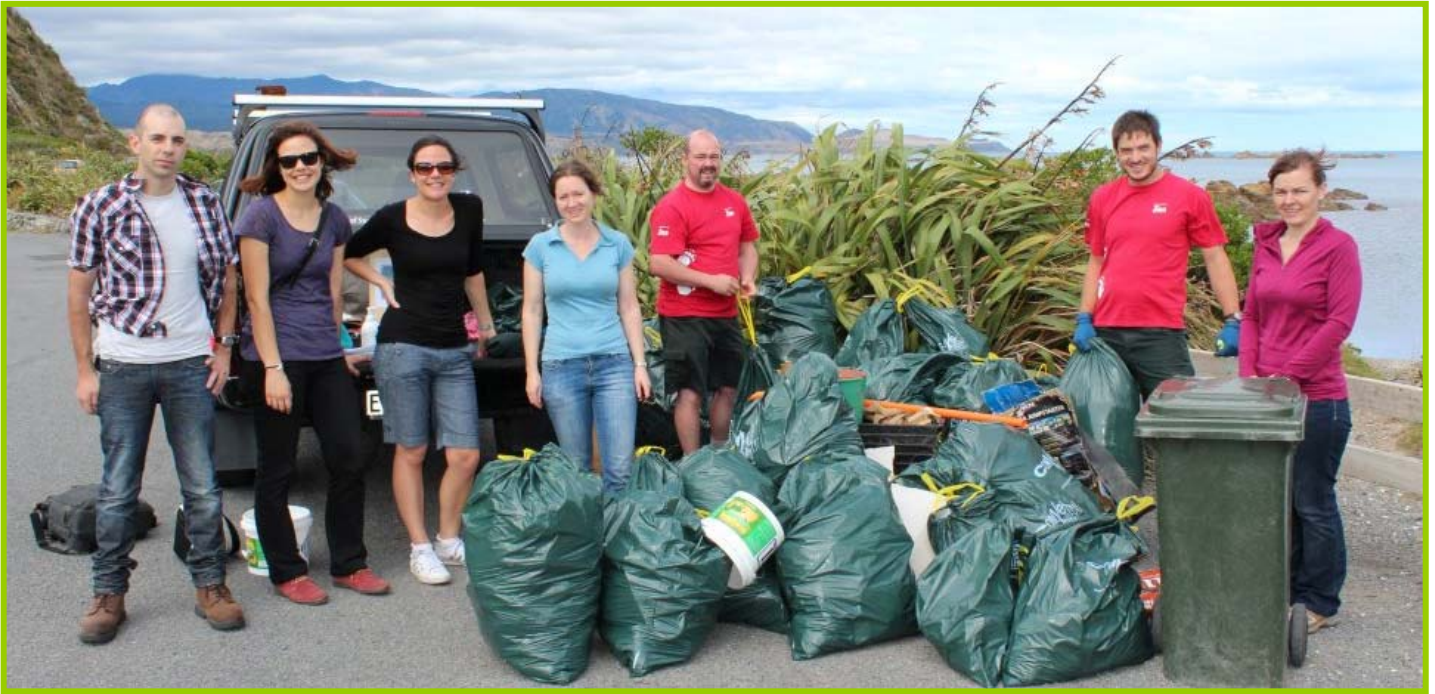
Zoo staff and volunteers from the Community at the Coastal Clean Up, part of Seaweeek – March 2012