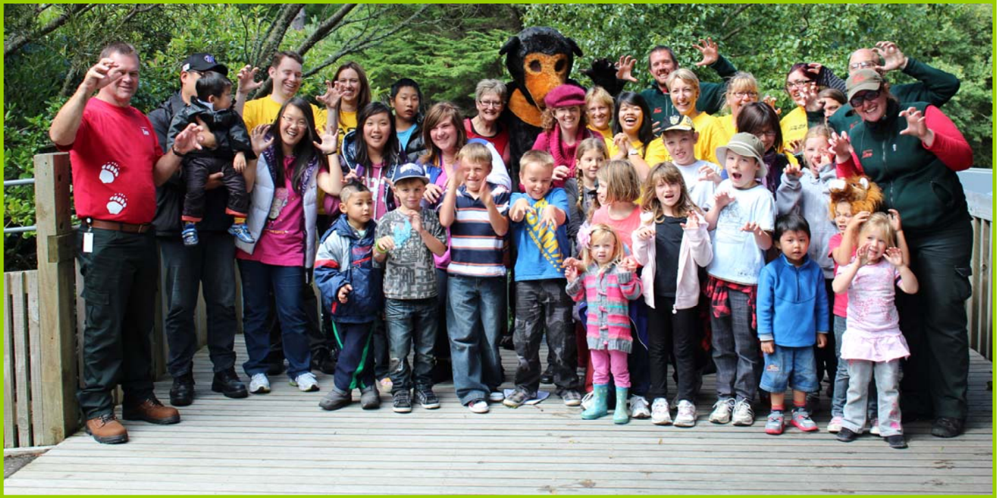
Children's Day with our visiting children, Zoo staff and Sun Bear sponsors ASB – March 5 2012