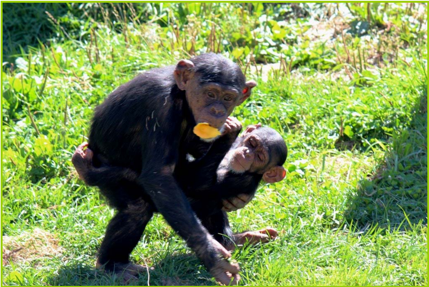
Beni our 3 year old Chimpanzee carrying little Malika (6 months) – 15 March 2012