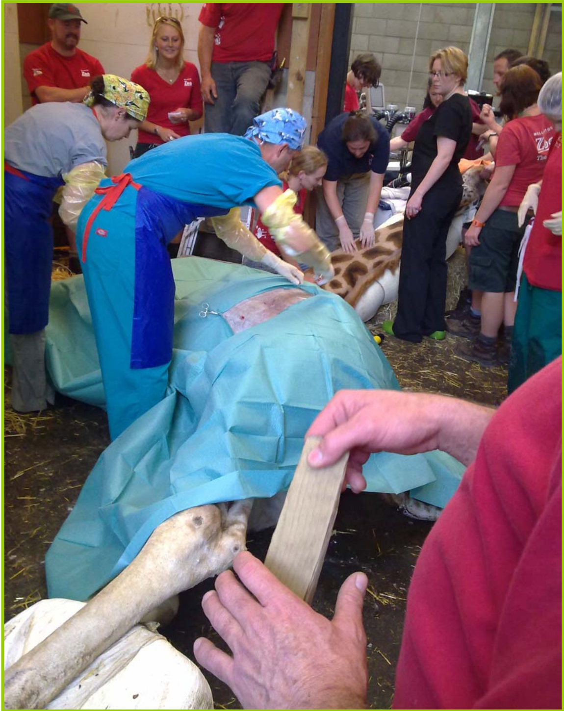
The Giraffe C-Section – March 2012