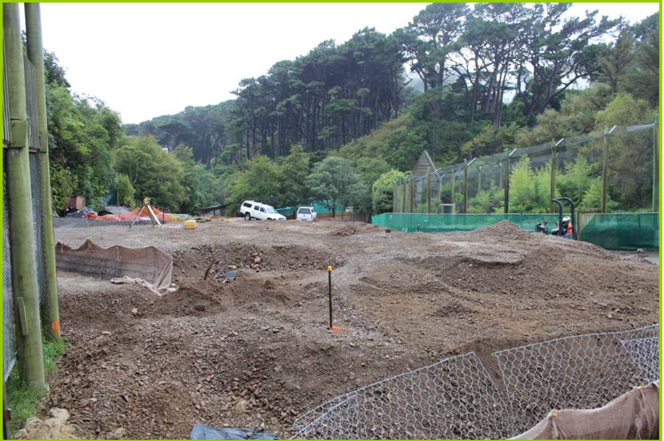
Asia Precinct – under construction 23 March 2012