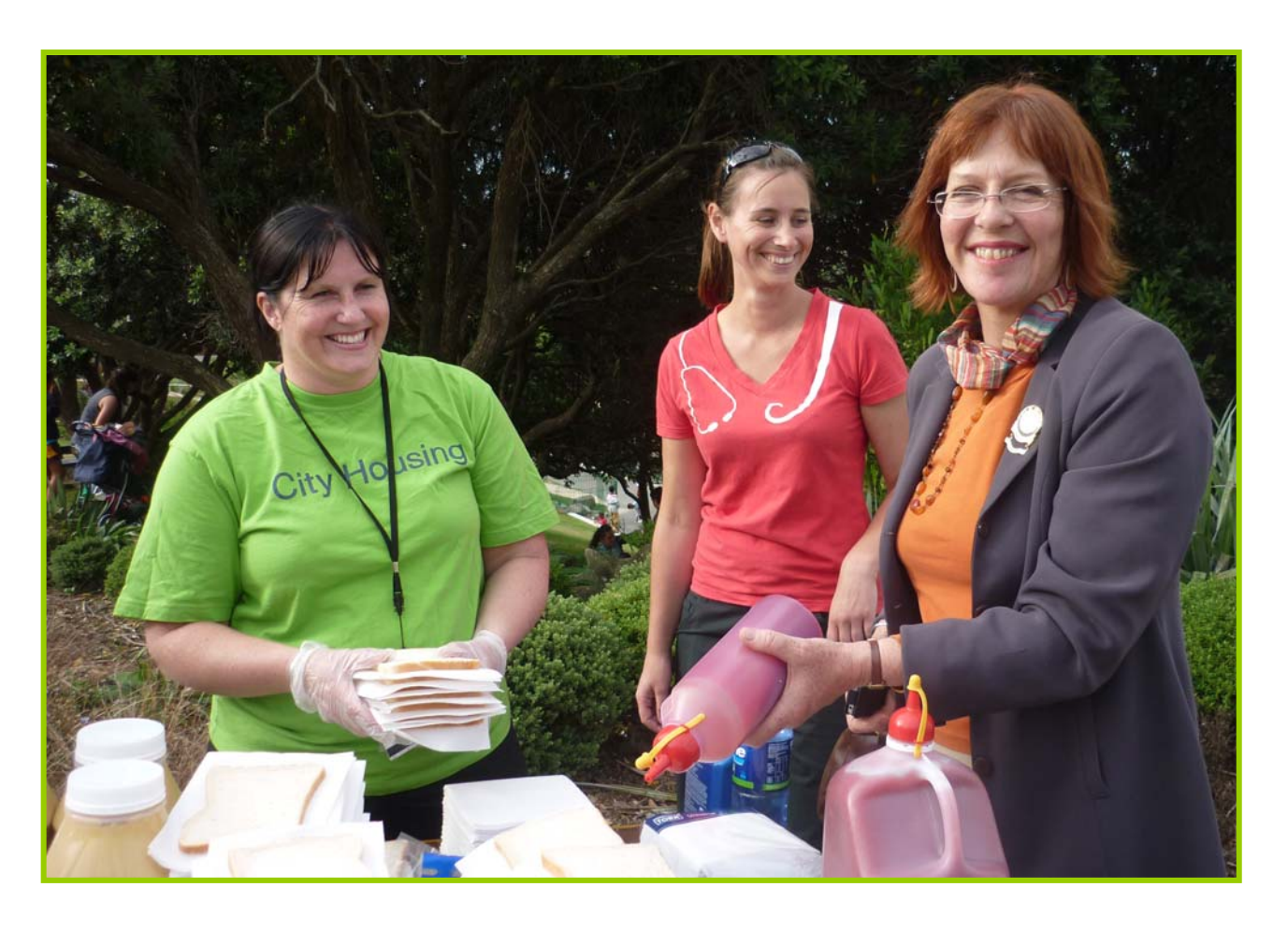
Mayor Celia Wade-Brown working at Wellington Zoo's annual Neighbours Barbeque – 27 January 2011