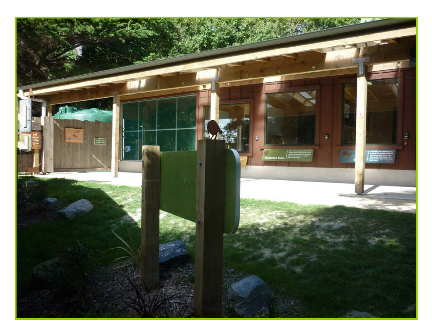
The Roost Te Pae Manu – Opened 14 February 2011