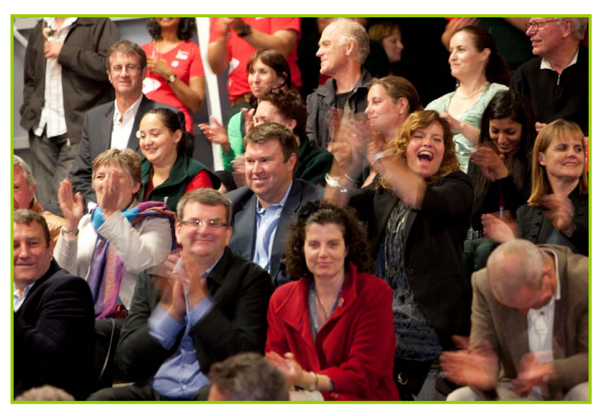
Guests at the Big Bite event during the Auction