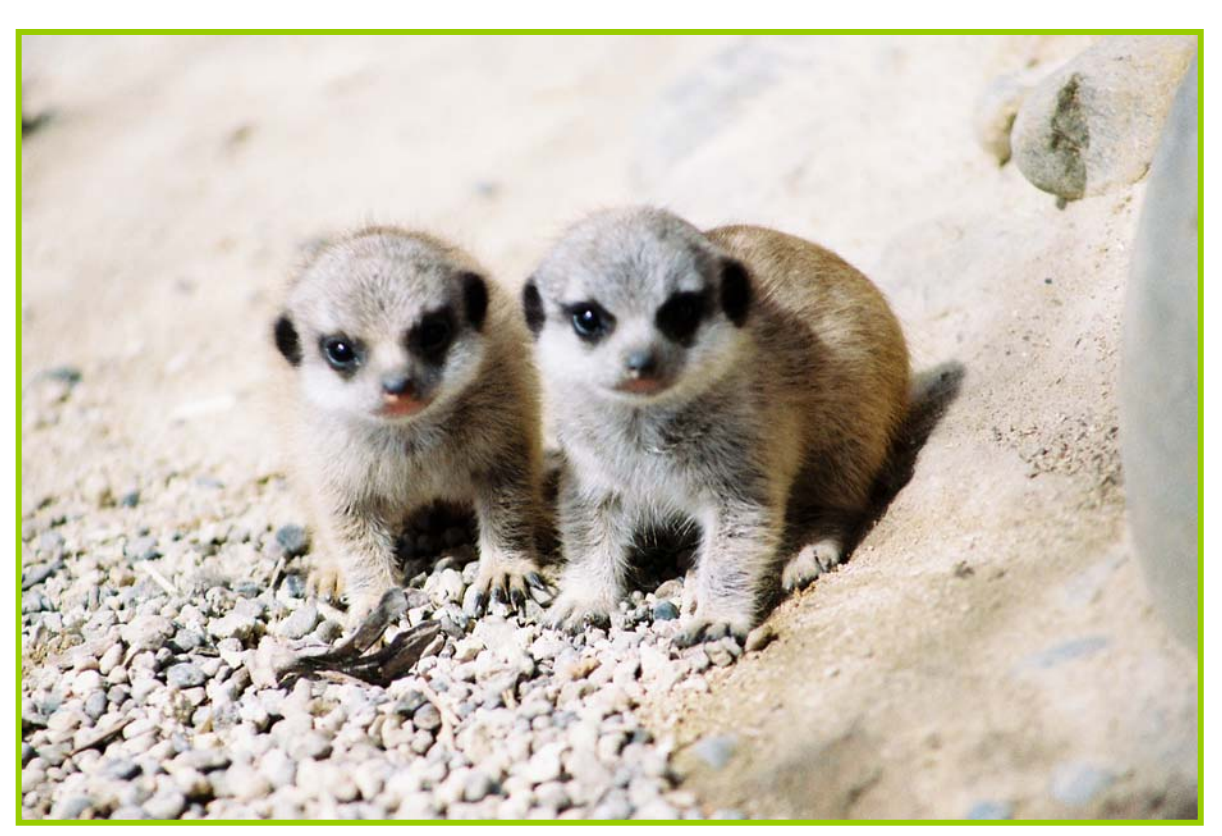
New baby Meerkats – Born February 2011