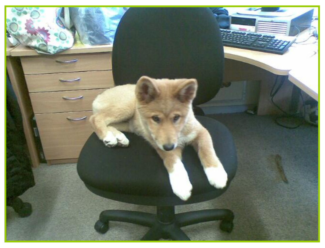
Wolfrik the Dingo Pup – Making himself at home