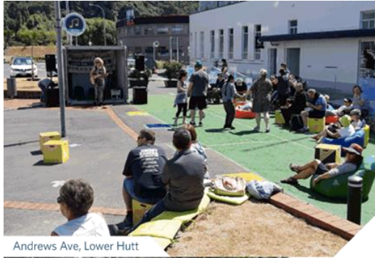
Andrews Ave, Lower Hutt