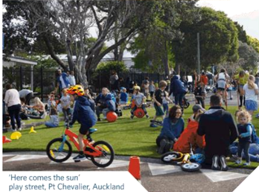
'Here comes the sun' play street, Pt Chevalier, Auckland