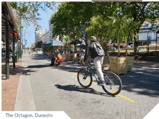
The Octagon, Dunedin