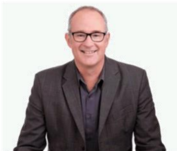
Hon Phil Twyford, Minister for Housing and Urban Development and Transport