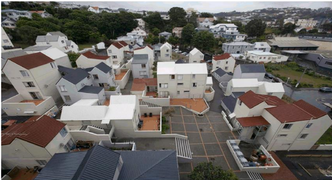
Arlington Apartments, Mount Cook