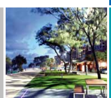
Proudly hosted by: