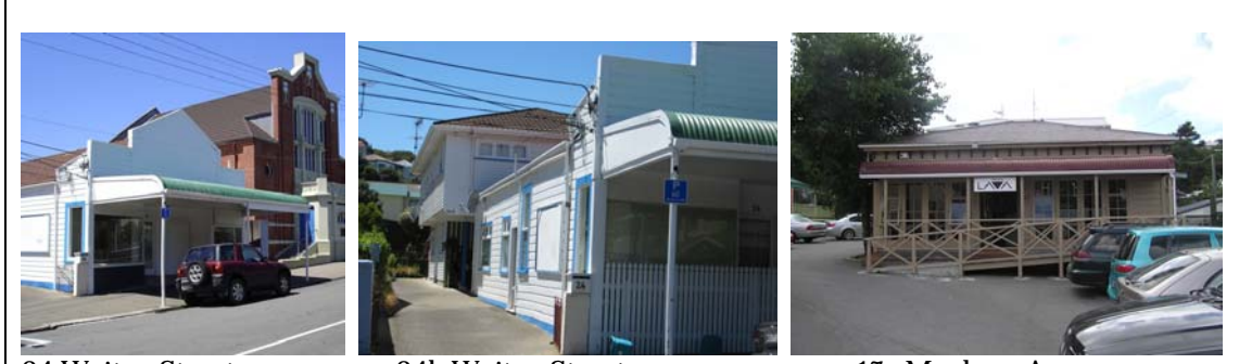
24 Waitoa Street

These submissions were opposed by further submitter FS6 (New Zealand Historic Places Trust) .