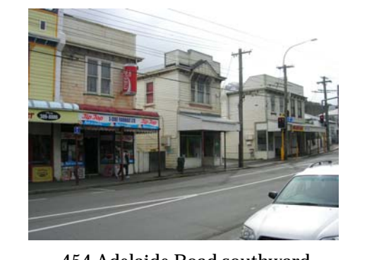
454 Adelaide Road southward

In response, the Hearing Committee note that this area was surveyed and it concluded that the historic streetscape was too fragmented, with too few buildings remaining. The area had also been compromised by a number of insensitive modern developments. It is for these reasons that this part of submitter 35's submission is not accepted.