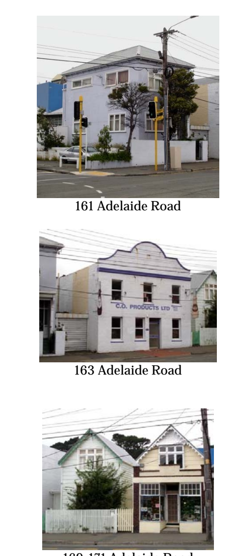
169-171 Adelaide Road

buildings should be excluded from the proposed area.