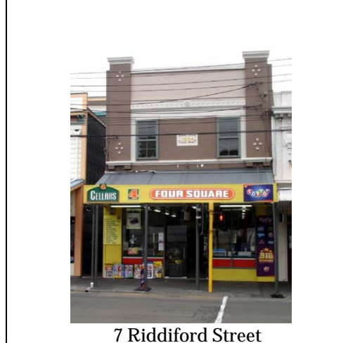
7 Riddiford Street

Given the broad nature of submission 28 (which is largely outside the scope of the plan change), the Hearing Committee could only comment on the points regarding the heritage value of The Rice Bowl building. The Hearing Committee agreed that this building should be indentified as a non-heritage building. Aside from this change, the Committee recommend that submission 28 is rejected.