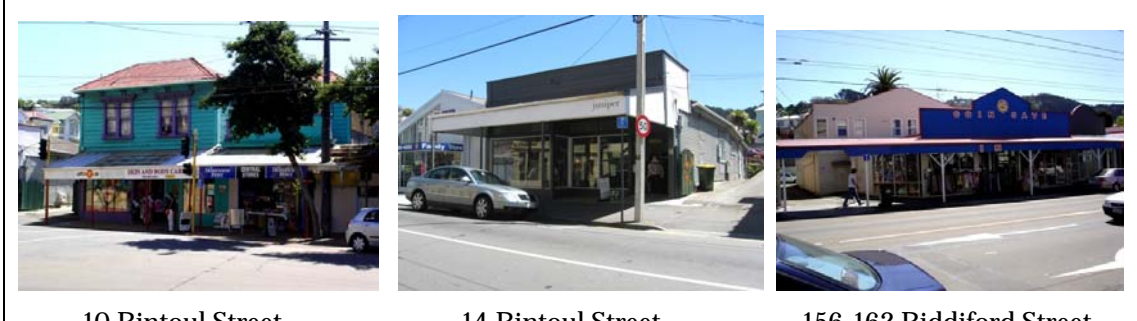
10 Rintoul Street

This building is closely related to number 8 and is a fusion of two conjoined but different two-storey Victorian buildings and a modern building. Number 10 retains traces of its original c1900 shop front, with the facade containing two pairs of doublehung windows in detailed surrounds. It is considered that the building contributes to the area and in this regard the submitter's request is not supported.