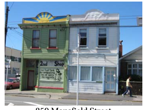
259 Mansfield Street