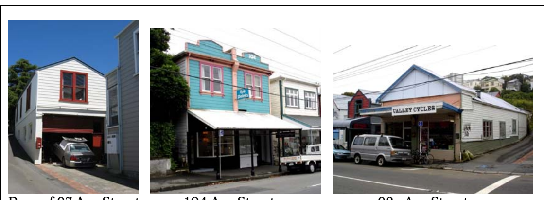
Rear of 97 Aro Street

Submitter 35 (The Architecture Centre) also requested that 93a Aro Street (framers and hair dressers) be identified as a non-heritage building in the area. This is a large single-storey commercial building that was originally constructed in 1900. It has seen much alteration over time, but on balance it is considered to still retain sufficient heritage fabric and historic connection to warrant inclusion in the proposed area.