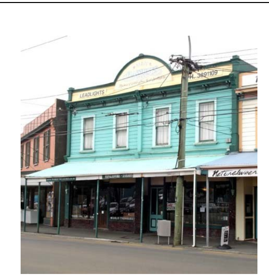
1-3 Riddiford Street