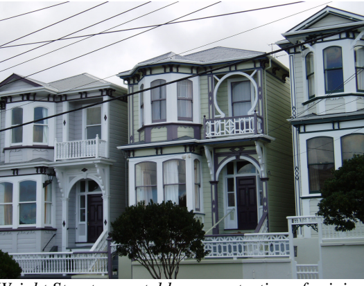
Wright Street - a notable concentration of original dwellings