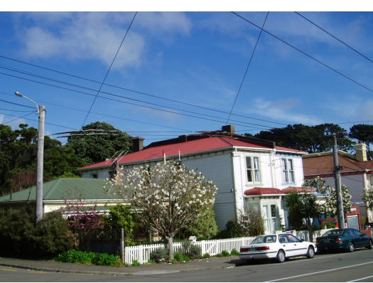
Limited range of building types

The area contains a relatively small number of multi-storey apartment blocks and town house developments of variable scale and layout. Most of the multi-unit development is located along or close to major streets and/or on larger or former industrial sites.