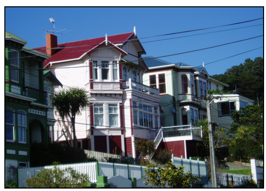
The undulating topography is a strong determinant of the area's overall character

The collective character of Wellington's Southern Inner Residential Areas is determined by the following common patterns: