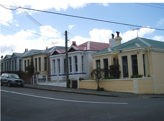
Consistency of building type and scale - notable grouping of semi-detached brick dwellings at the southern end of Rintoul Street