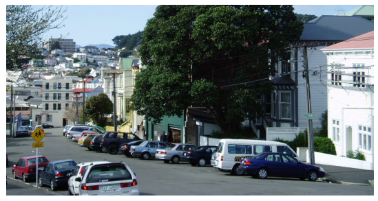
Carparking is typically on the street

Most of the existing garages are found along the higher side of streets. Garages on steep frontages, typically built into the slope and located in front of and below the dwelling, have a lesser impact on the streetscape than free-standing garages.