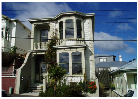
Entrances and main windows addressing the street

Currently most building exteriors are light in colour. However, houses built during the 1890-1910 period were traditionally painted in deeper colours with strong contrasts used to enhance decorative detailing and roof forms.