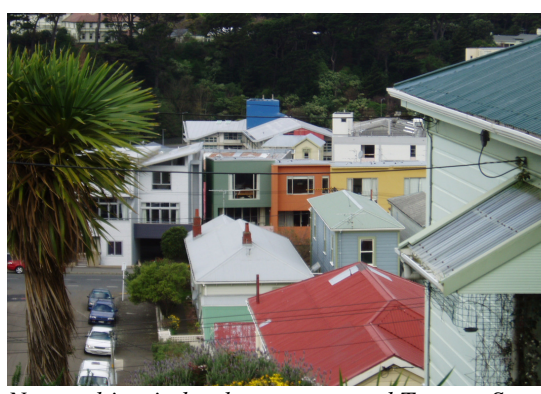
New multi-unit development around Tasman Street