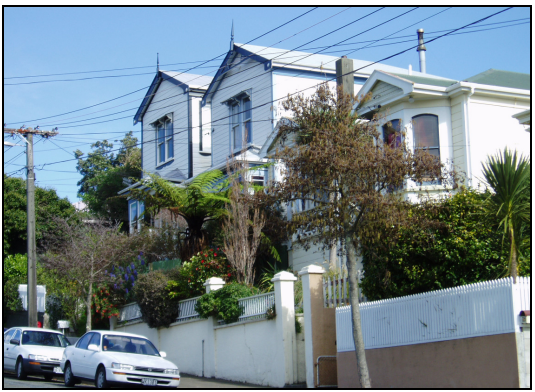
The area is a mixture of one and two storey dwellings

A combination of generally narrow lot frontages (average 10m width) and small separation distances (average 2m) creates a