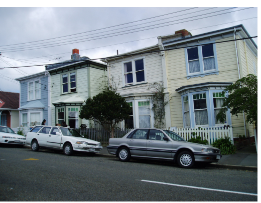
Consistency of character and a high degree of visual unity