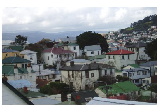
Intricate roofscape demonstrating consistency of roof type and pitch