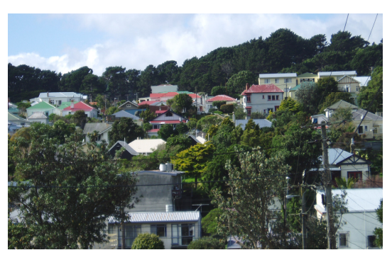
High intensity development is typically compensated for by mid-block open space with mature vegetation

Variation of front yard dimensions usually relates to variation of topography. Dwellings on sites sloping steeply up from the street typically have deeper frontage setback than those on flat or downward sloping sites.