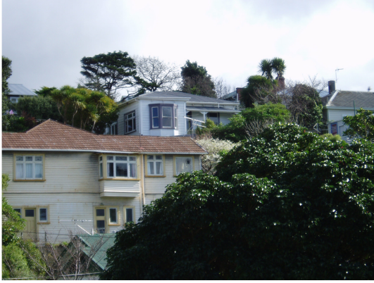
Akatea Street - strong streetscape presence accentuated with prominent mature vegetation