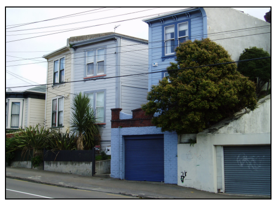
Defined street edge with buildings typically aligned with the street grid