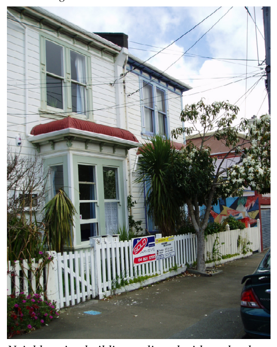
Neighbouring buildings, aligned with each other give a strong street edge definition