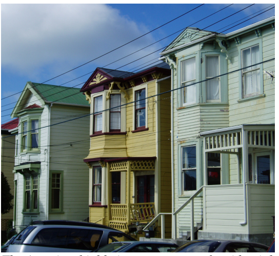
The Area is a highly intact remnant of residential housing from the first decade of the 20<sup>th</sup> century

The general intactness of the area's urban fabric is largely due to the relatively limited number of new developments. New development occurs primarily in the form of multi-storey apartment blocks, typical around Riddiford Street, Adelaide