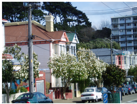
Distinctive local character with a strong sense of place

At the same time, the area exhibits a sense of visual diversity. This is derived from variations in roof form and building height, often accentuated by topographical variation and further enhanced by the presence of non-residential building types.