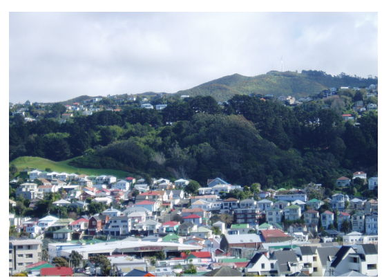
Visual diversity derived from variations in roof form, building height and topography.