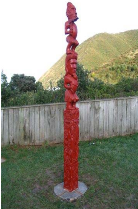
Above Left: Wellington's pou whenua standing over Owhiro Bay on the South Coast.

The pou whenua, pictured below, is three metres long and will weigh approximately 75 kilograms. Council officers have been working with Air New Zealand and the Council's iwi partners on freight arrangements for the pou.