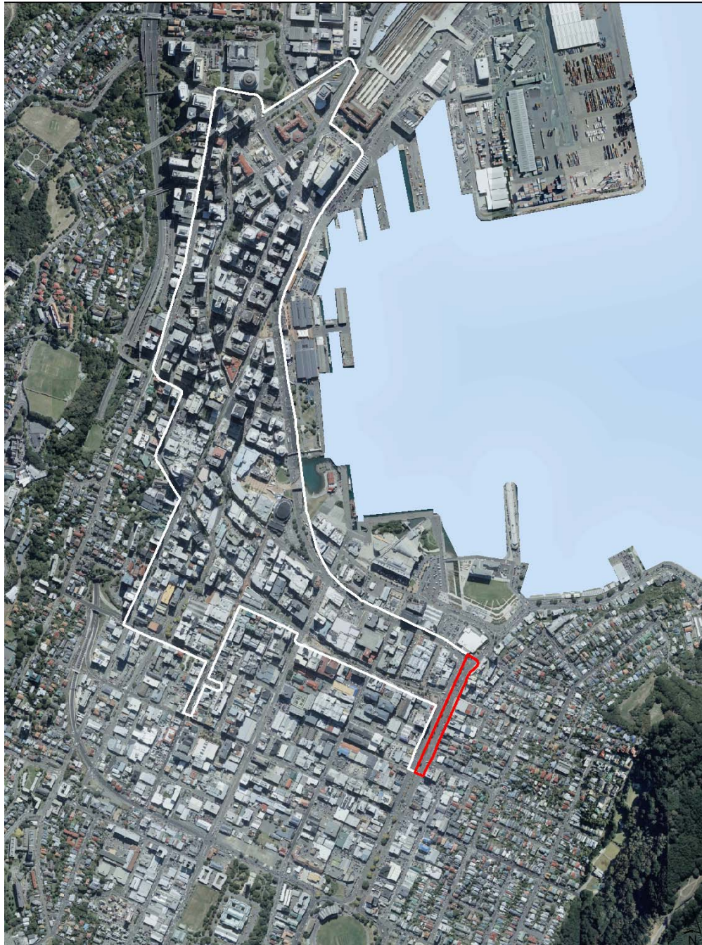
MAP 1: CENTRAL CITY RESTRICTED AREA

DATA STATEMENT Map's boundaries and information NZ Geomatics Ltd. data. Copyright reserved. Scale: 1:50,000. Source: NZ Geomatics Ltd. 2018. Other data has been compiled from a variety of sources and is not guaranteed. Source: NZ Geomatics Ltd. 2018. Topographic data: Wellington City Council. NZ Geomatics Ltd. 2018. Source: NZ Geomatics Ltd. 2018. Any content displayed on this map is for information only and must not be used for engineering design. Colour Orthorectified 1:50,000 from 1998 corrected by Wellington City Council.