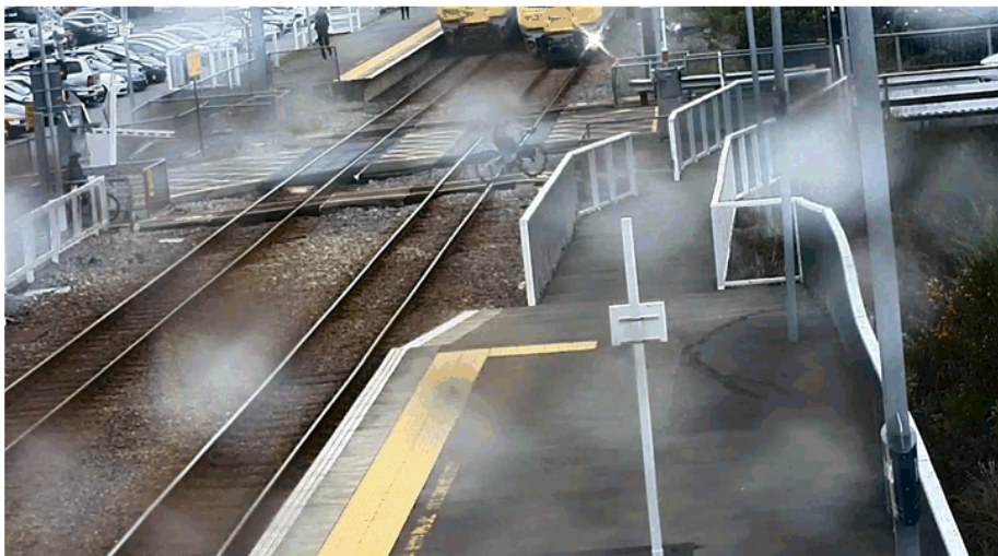
Near collision 29 March 2017, image from platform CCTV, northbound train travelling 55kmh