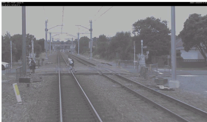
Near collision 25 February 2016, image from Matangi express train, travelling 85kmh