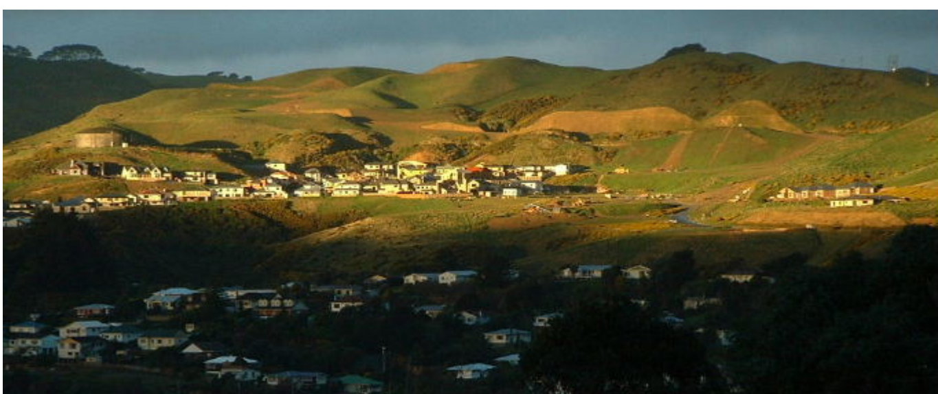
Late sun on the eastern hills of Tawa