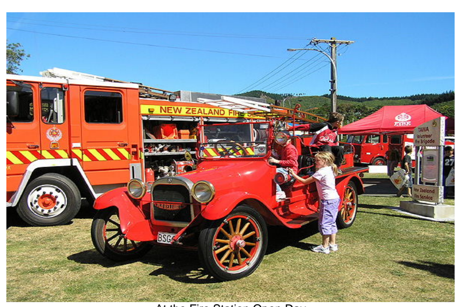
At the Fire Station Open Day