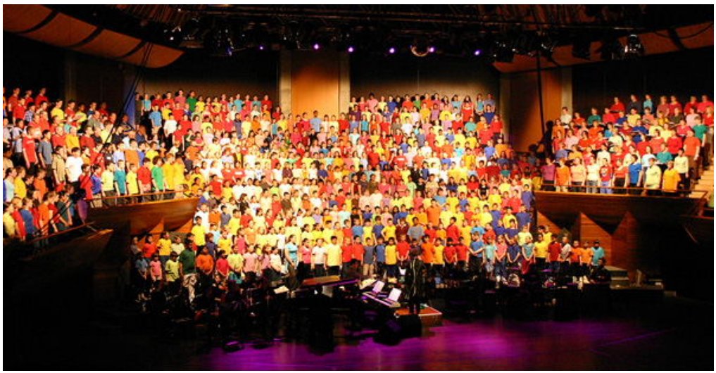
Most of the 900-strong choir at the Tawa Schools & Community Music Festival