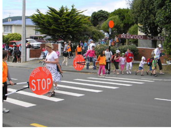
End of the day at Redwood School