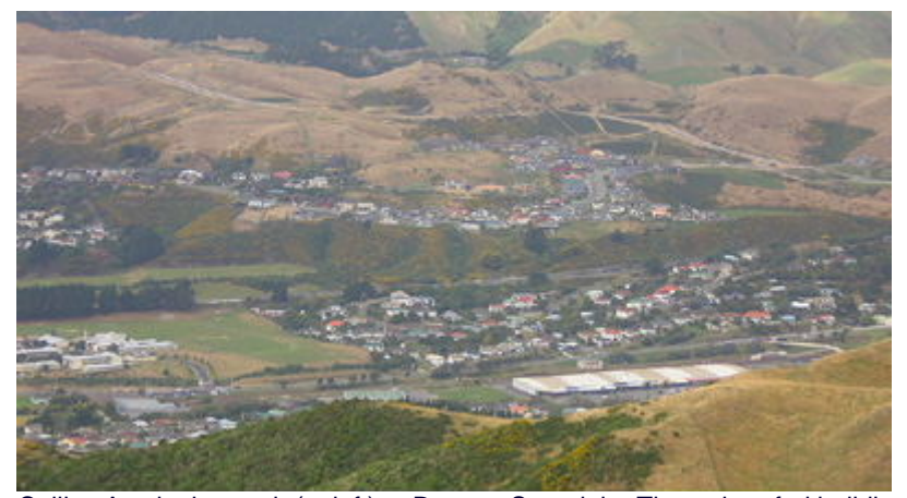
View of Tawa from Collins Ave in the north (at left) to Duncan St at right. The red-roofed buildings at left are Linden School. The Intermediate School and College can be clearly seen in the centre of this shot, along with the College's 'top fields' above the row of trees. To the right of that, and moving up a little, is the southern end of Woodman Drive with its newish housing. Behind that is the new road heading up the hill.

The Tawa Community Board (TCB) is concerned that the WCC is not of the view that the Tawa Community is a community of interest (in terms of representation purposes) and believes that insufficient regard has been taken of Section 14(2) of the LGA when reaching its initial proposal to abolish the Tawa Community and the TCB.