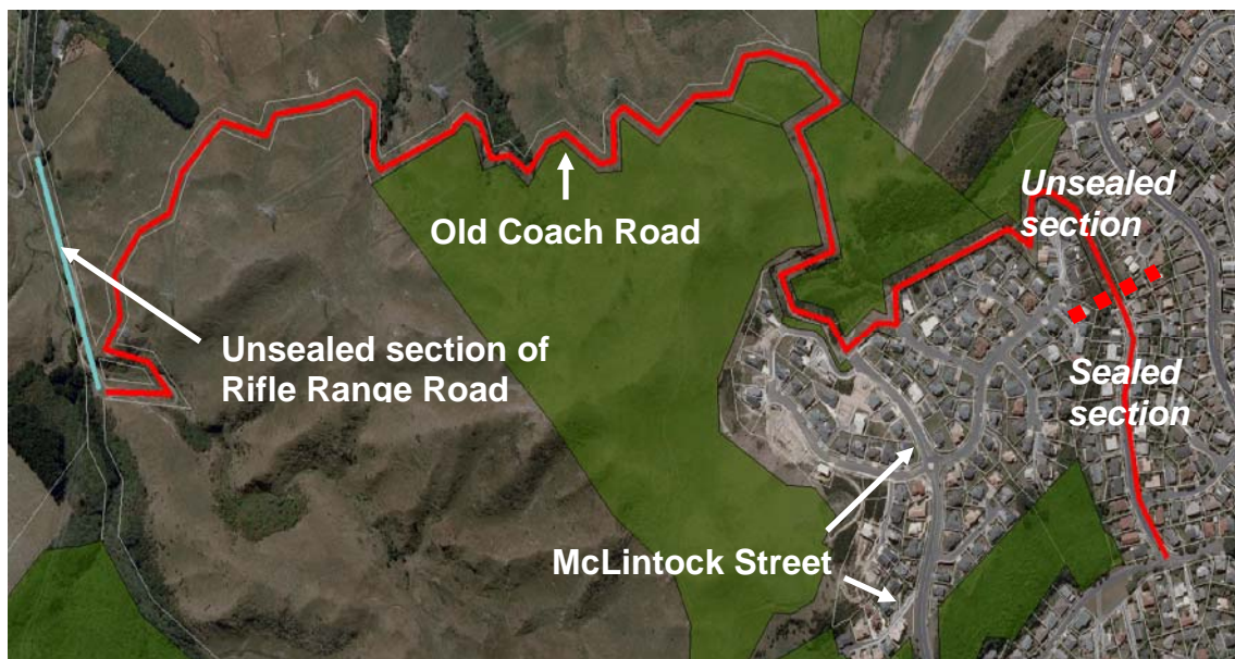
Figure 1: Map of Old Coach Road (highlighted green areas = Council owned land)

Residential housing in Johnsonville borders the unsealed Old Coach Road. As part of the earthworks associated with the development of the housing on McIntock Street, approximately 250m of the original track was covered with fill in the early 1990's.