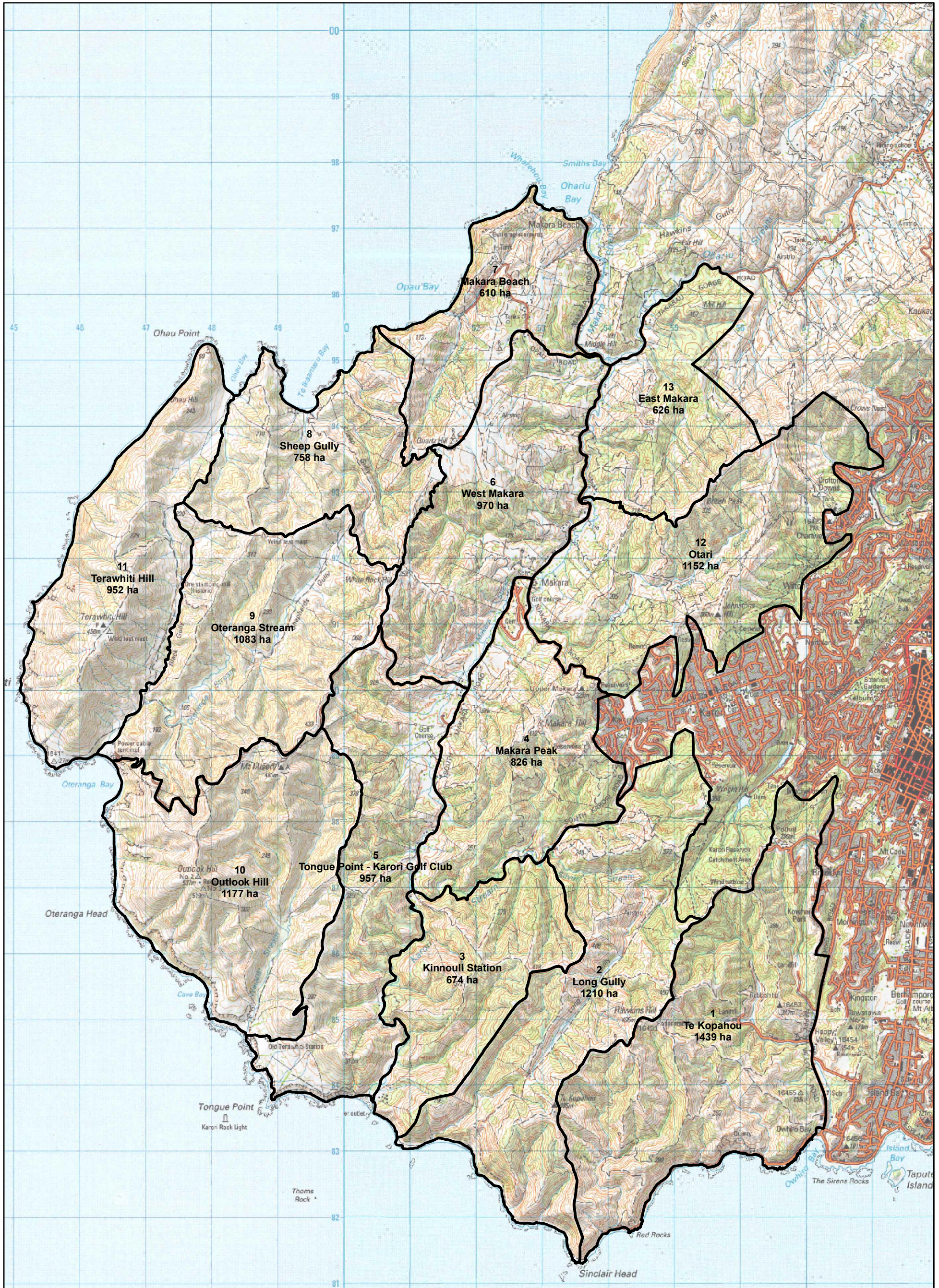
Figure 4. South-West Wellington Goat Management Blocks