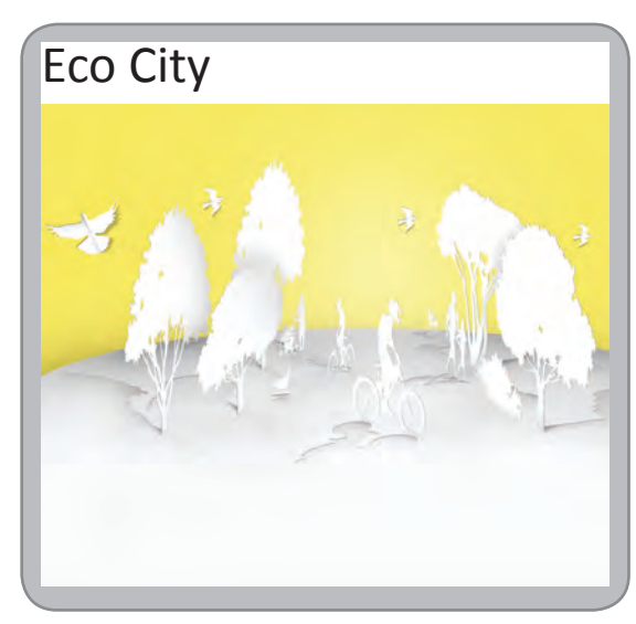
Figure 3. This framework outlines the ways in which we can have a more dynamic central city.