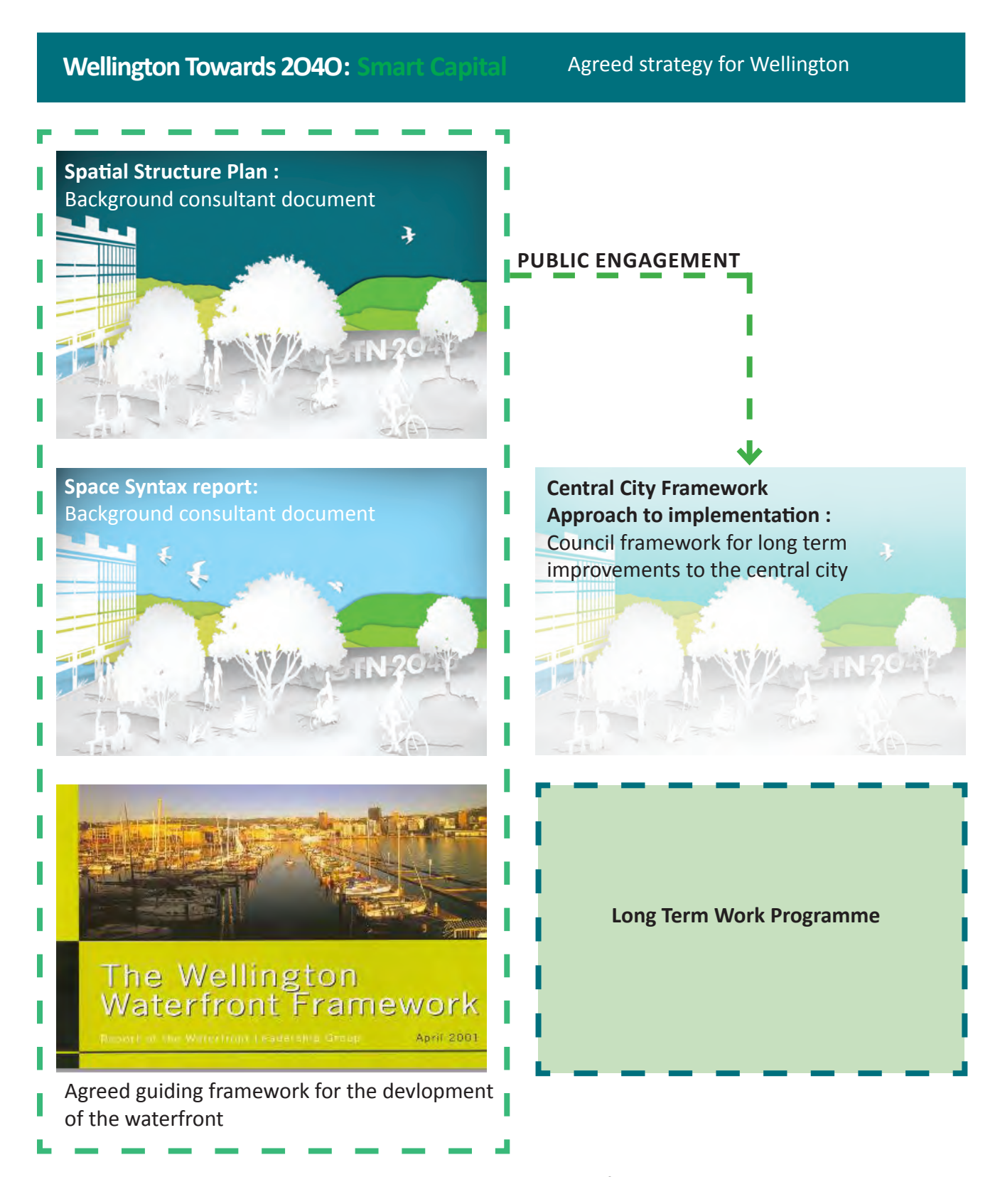
Figure 1. Wellington Towards 2040: Smart Capital sets the overall strategy for Wellington. The Central City Framework describes how we could implement the recommendations from overseas consultants, local experts and the general public. The next steps will be to gather further information on the projects suggested to formulate a long term work programme.