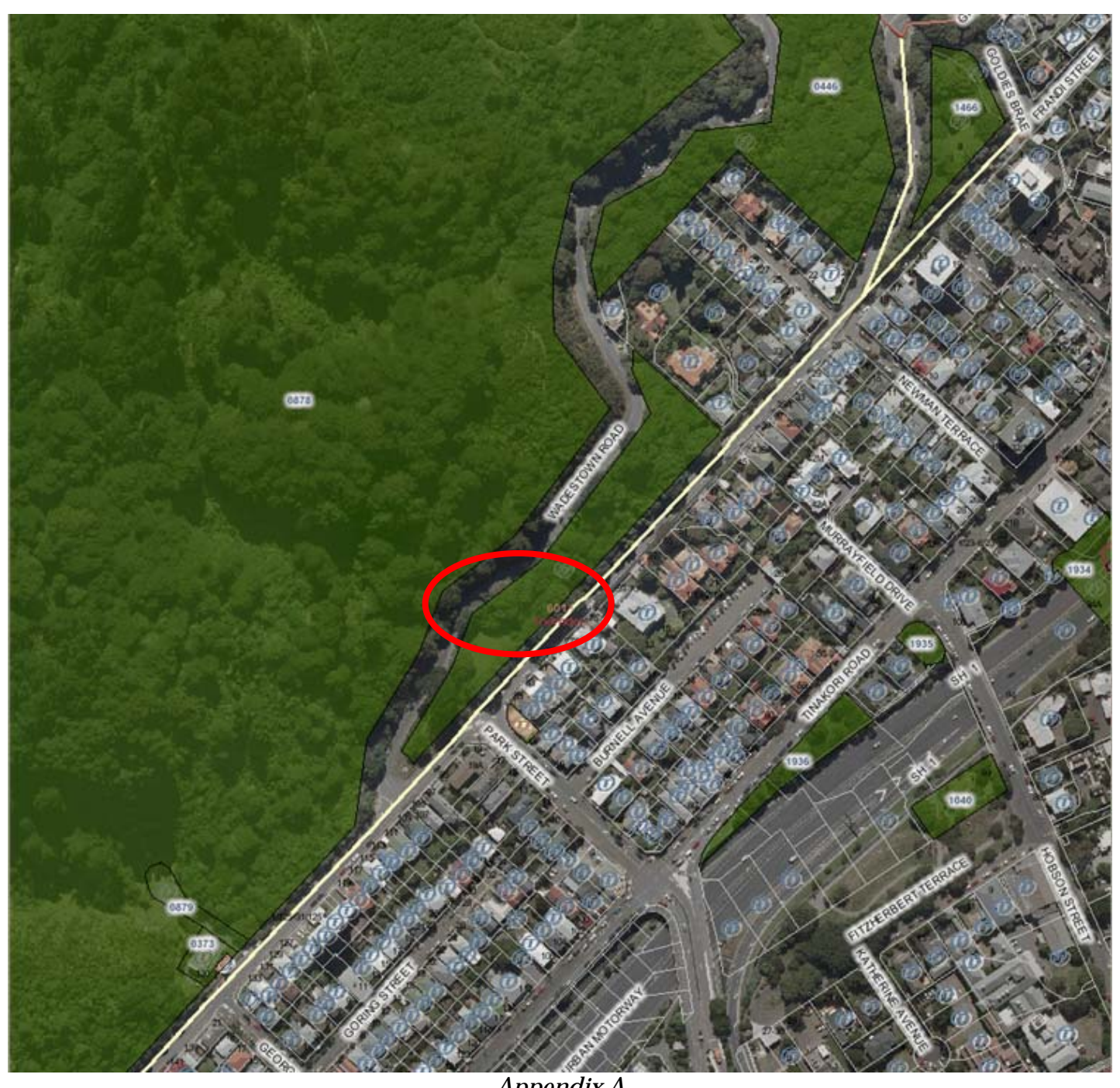
Appendix A Location Plan