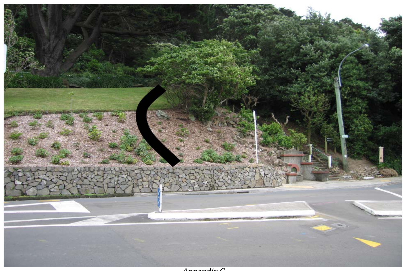
Appendix C Proposed Easement