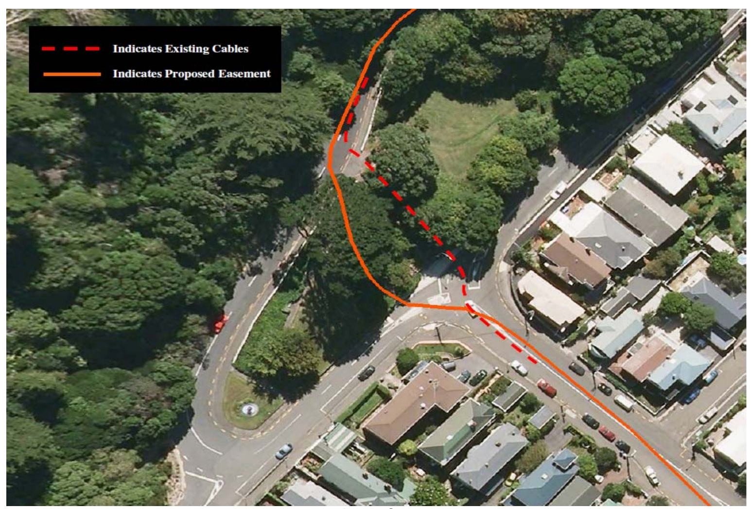
Appendix B Existing and Proposed Easements