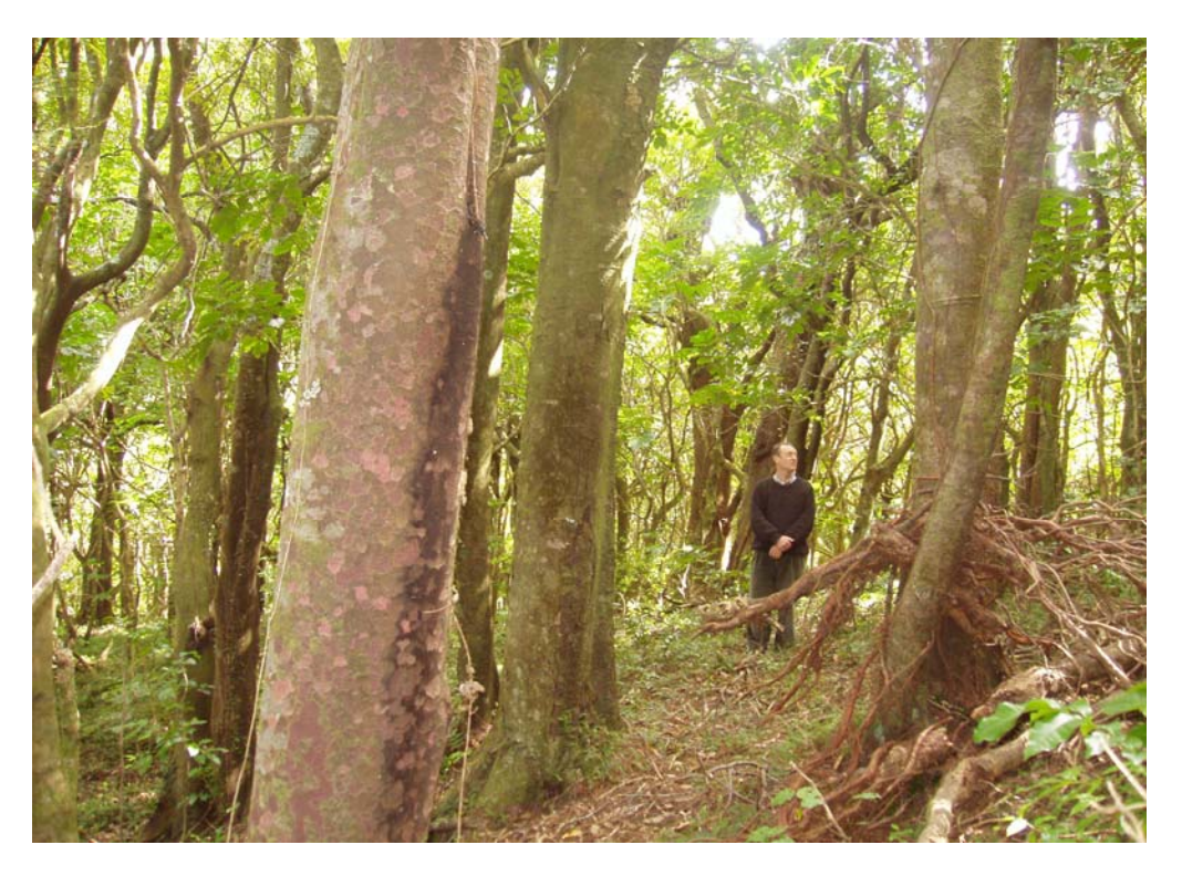
Photo 7: Podocarp-broadleaved forest: Plot 8/1 with large matai at left. Kahikatea and tawa also present in canopy.