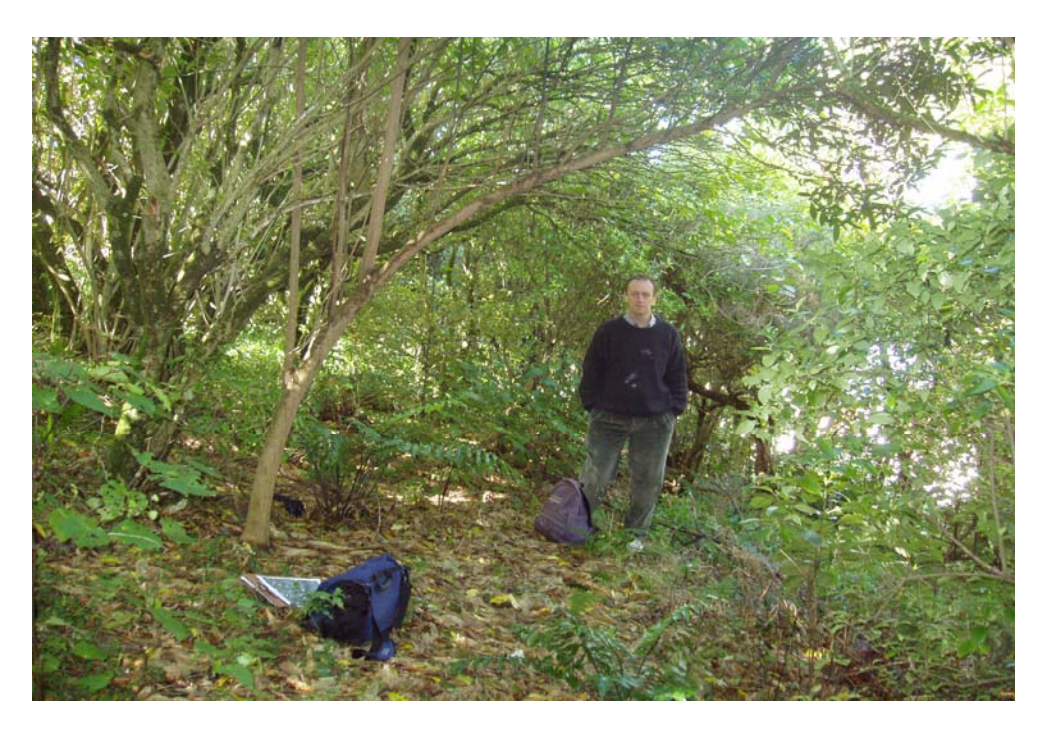
Photo 5: Mahoe-dominated broadleaved forest: Plot 4/1. Note open nature of vegetation.