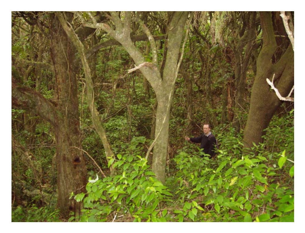
Photo 8: Kohekohe-dominated broadleaved forest: Plot 6/6 looking across small gully.