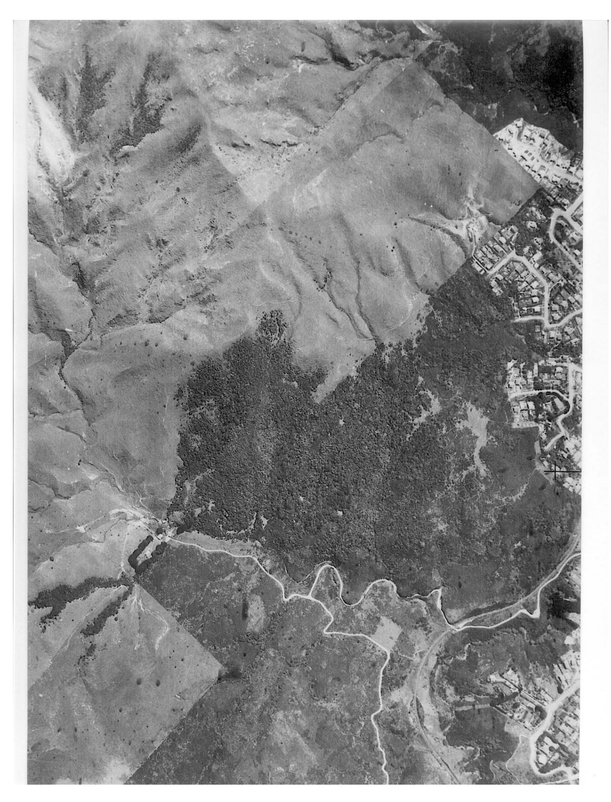
Photo 3. 1941 aerial photo of Silverstream Valley (Korimako Stream) and study area.