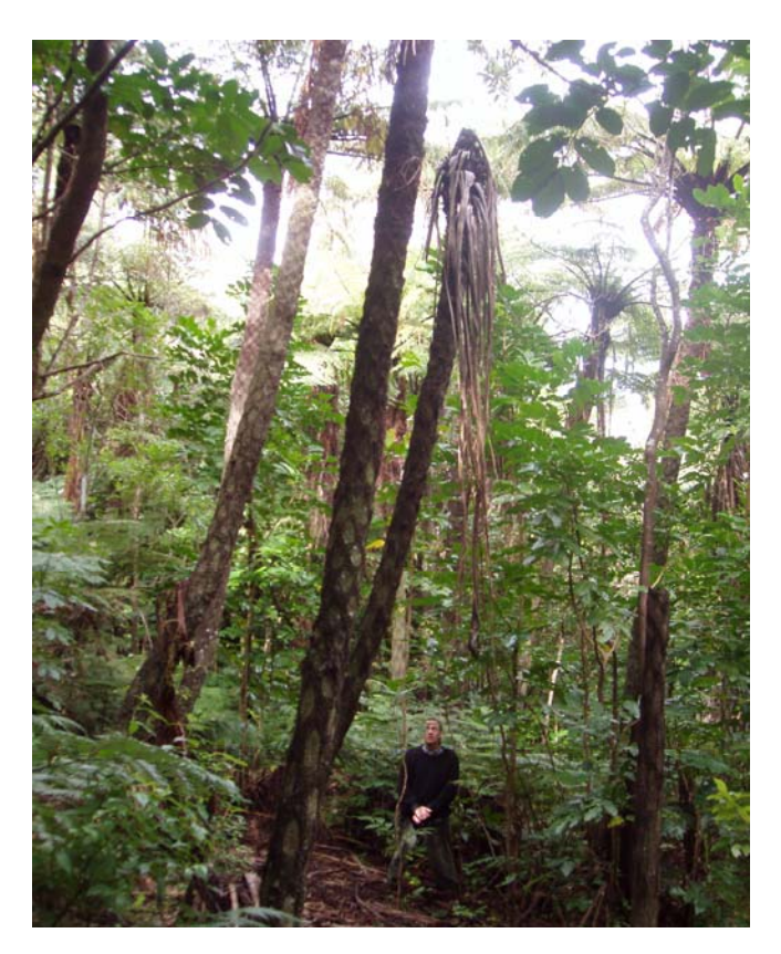
Photo 9: Treefern land. Tall mamaku in canopy, smaller treeferns and broadleaved shrubs below.

Photo 8: Kohekohe-dominated broadleaved forest: Plot 6/6 looking across small gully.