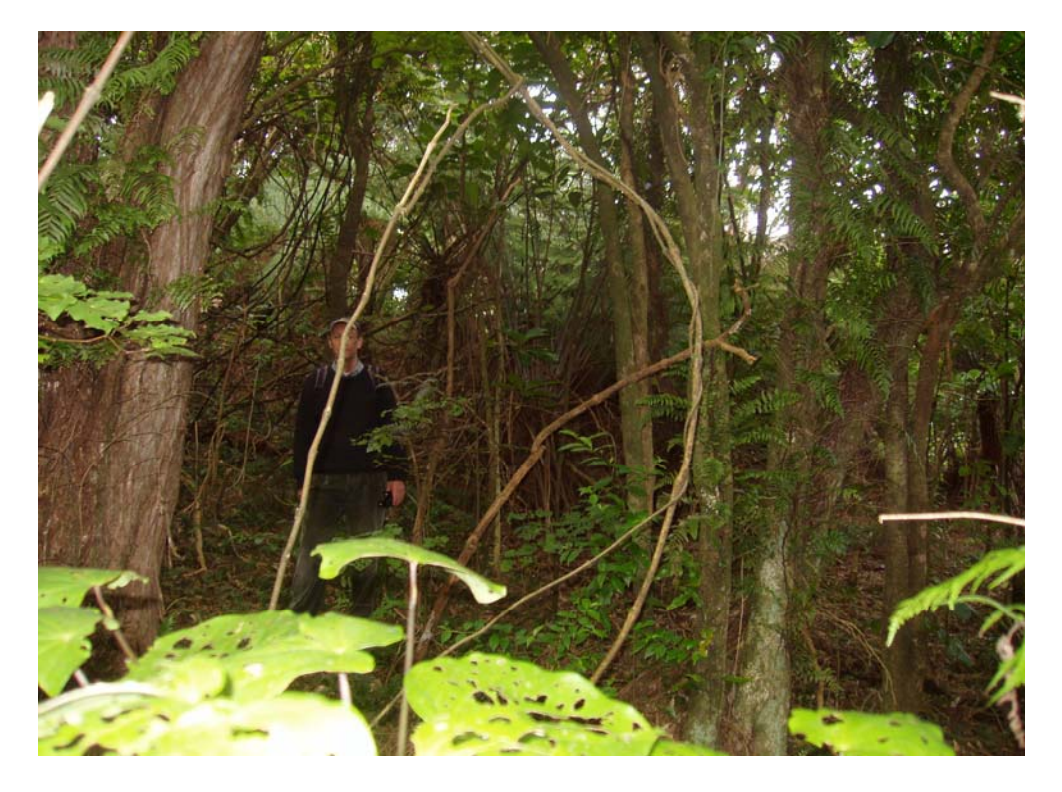
Photo 4: Mixed broadleaved forest: Plot 6/3 with large kanuka at left.