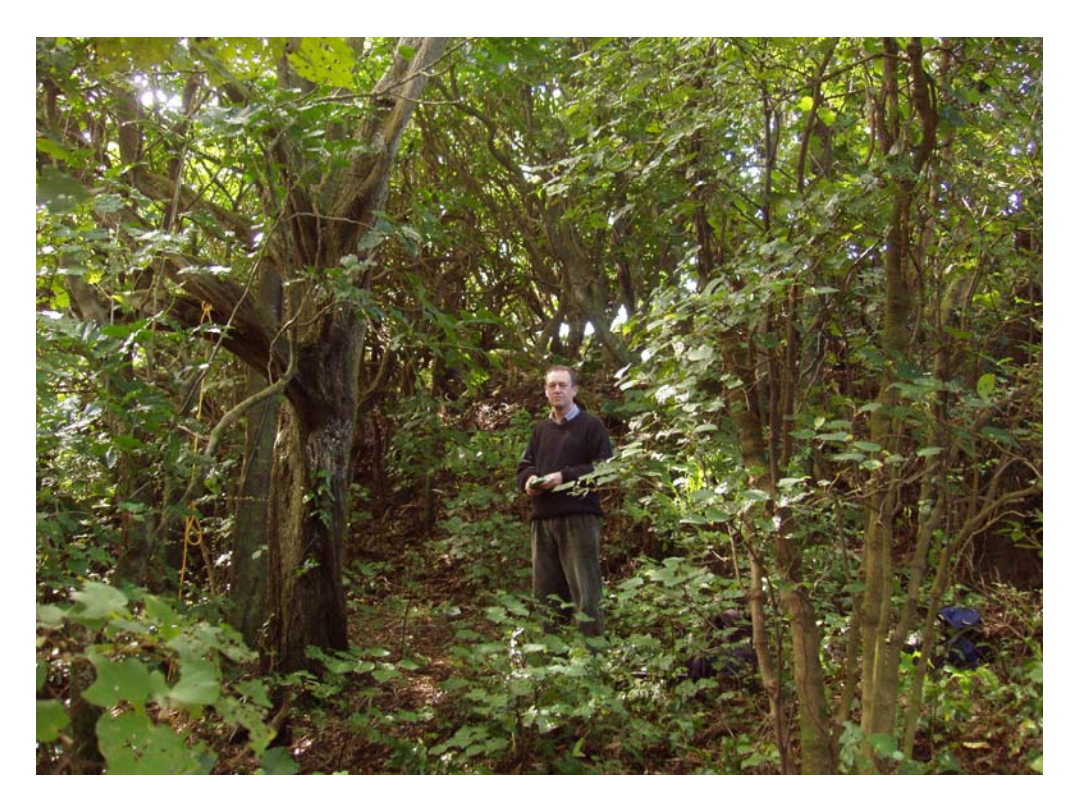
Photo6: Podocarp-broadleaved forest: Plot 2/3 with damaged totara. Sub-canopy is open and younger, suggests relatively recent grazing.