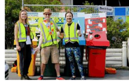
Zero Waste Station 14 4 March 2018

The 450 street stalls contribute a huge part to the day. In 2019 there were 151 stalls selling food and beverages from around the world, 65 community group stalls (all at a discount rate, or free) raising awareness, providing information and fundraising amongst our crowds. Every year our team trains a cluster of refugee and migrant stallholders in safe food handling so that they can run a food stall and showcase their authentic and delicious ethnic cuisine.