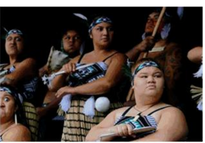
Tangata Whenua Stage 4 March 2018

The Fringe Festival plan their dates so the first weekend of the Fringe coincides with Newtown Festival and CubaDupa is on after the Fringe.