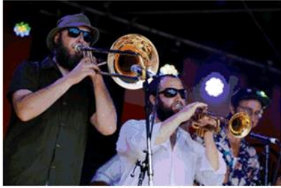
Newtown Rocksteady South Stage 4 March 201

Newtown Festival is very appreciative of the 26 years of production partnership funding from Wellington City – secure 3 year WCC contract funding and City Events sponsorship help take care of some of the core event framework.