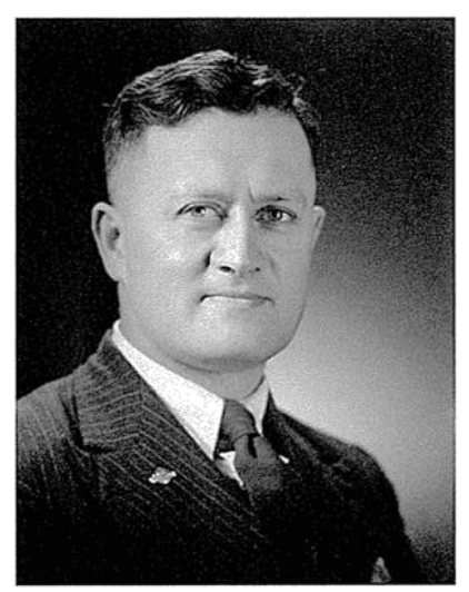
Figure 2: James Clendon Hēnare, photographed circa 1945. reference # 1/4-020163-F.