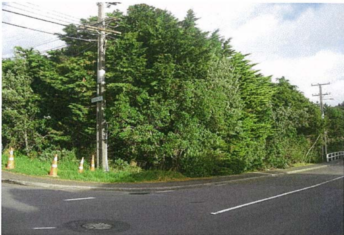
Subject land from Cunliffe Street