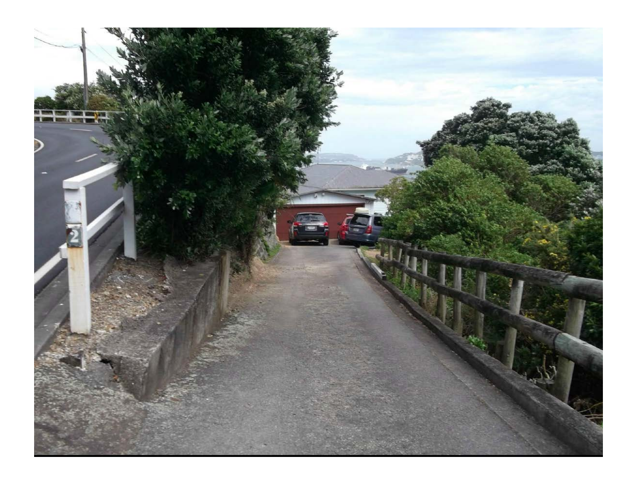
Photo of driveway to 62 Onslow Road partly straddling adjoining Reserve land at 56 Onslow Road.