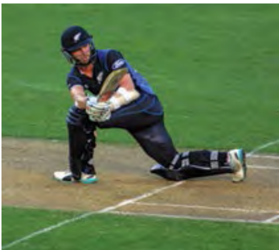
BLACK CAPS VS SRI LANKA 29 January 2015

In other world cup matches in Wellington, Sri Lanka defeated England by nine wickets in front of 16,947 fans, while South Africa defeated UAE by 146 runs with 4,747 in attendance.