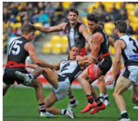
ST KILDA VS CARLTON 25 April 2015