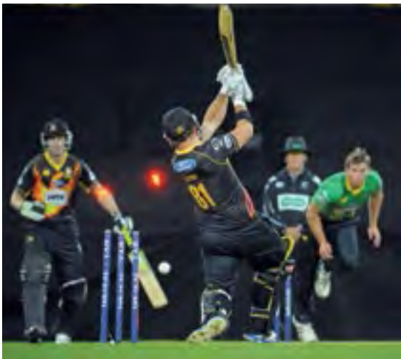
WELLINGTON FIREBIRDS VS CENTRAL STAGS 23 November 2014