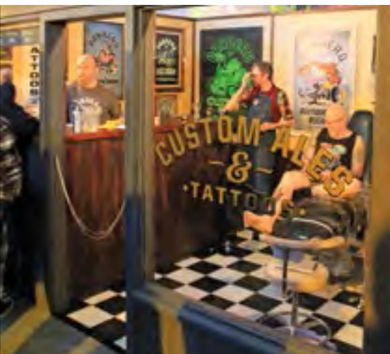
BEERVANA 22-23 August 2014