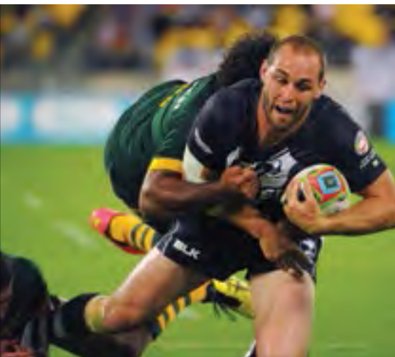
KIWIS VS AUSTRALIA 15 November 2014