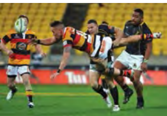
LIONS VS WAIKATO 16 August 2014

Another very full year saw 61 event days, which included eight community event days held at the Stadium. The 53 major event days was the equal highest since the Stadium opened. A total of 531,861 fans streamed through the gates, our highest since Rugby World Cup 2011, taking the cumulative attendance at the Stadium since it opened to over 8.25 million.