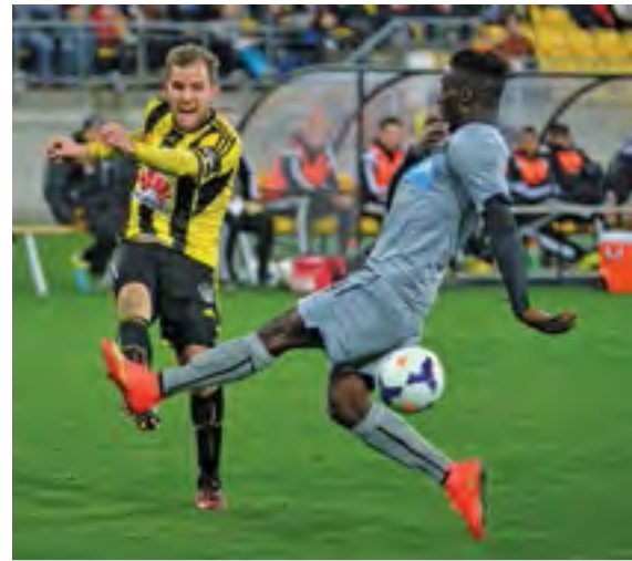
PHOENIX VS NEWCASTLE UNITED 26 July 2014

Catering is an area where we are constantly seeking improvements. We recognise that this is at the pointy end of the game day experience.