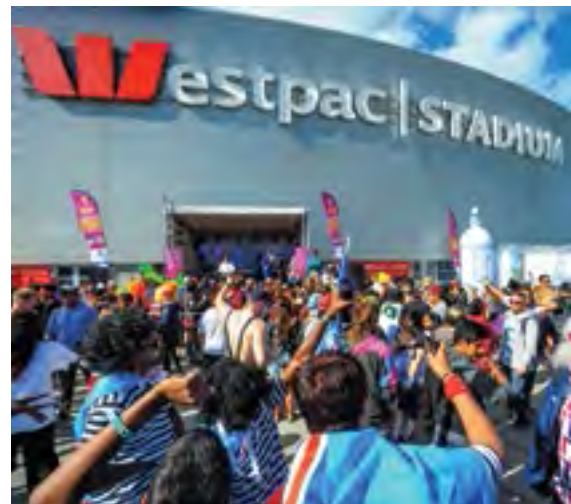
SEVENS TOURNAMENT 6-7 February 2015