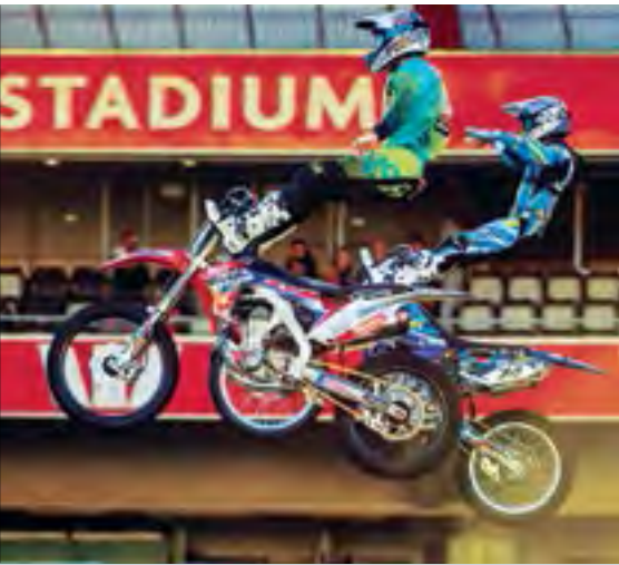
NITRO CIRCUS 24 January 2015