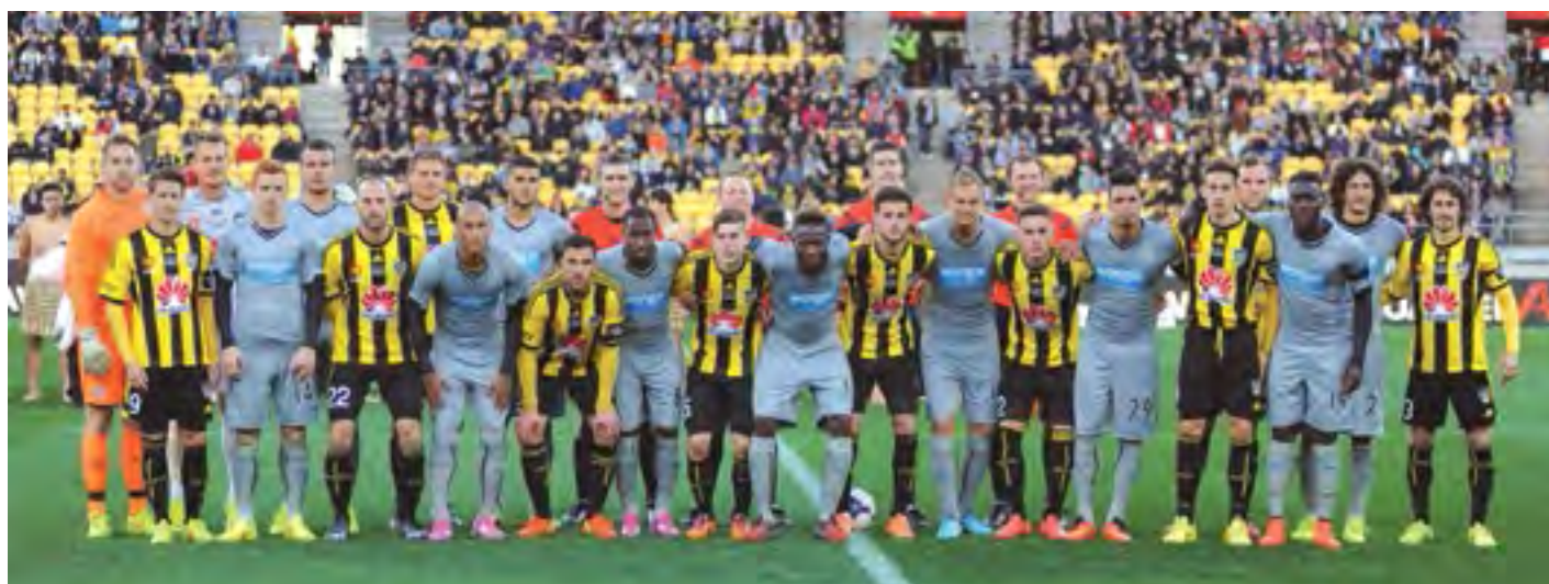
PHOENIX VS NEWCASTLE UNITED 26 July 2014