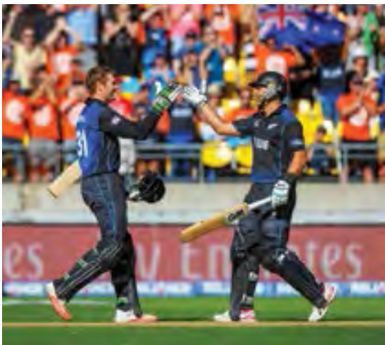
BLACK CAPS VS WEST INDIES 21 March 2015