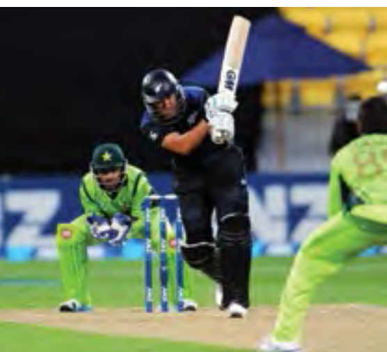
BLACK CAPS VS PAKISTAN 29 January 2015