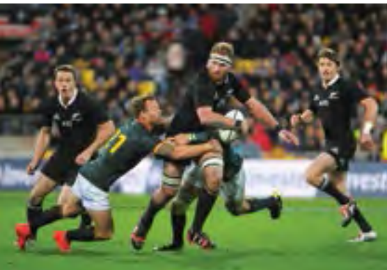
ALL BLACKS VS SOUTH AFRICA 13 September 2014