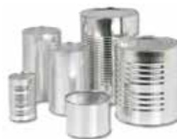
Tins & cans

Contact your local council for more information about which types can be accepted