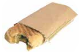
Vegetable wax coated paper

This is the only greaseproof paper which can be composted