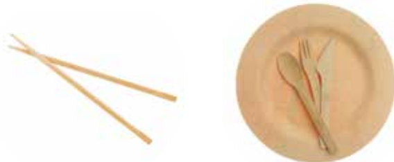
Soft/thin bamboo materials & cutlery