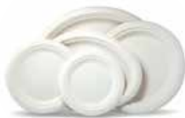
Sugarcane or Bagasse