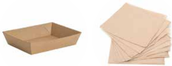
Unlined paper & cardboard

Materials accepted into the commercial compost include certified food packaging products made from: