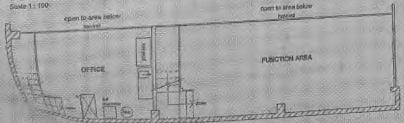
BASEMENT FLOOR PLAN - AS EXISTING